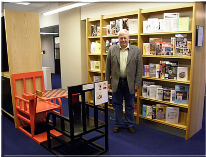
Our webmaster had arrived at