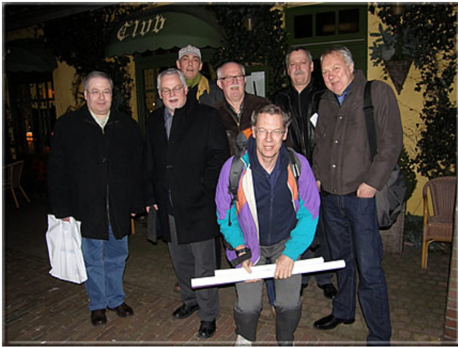
The final group photo in front of the "Horse Club"