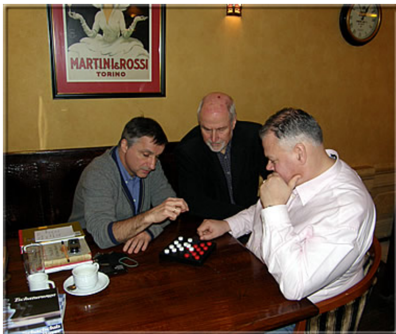
Our Dutch bridge expert showed some enthusiasm for Laska as well.