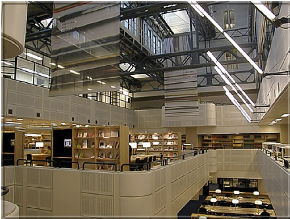
A view of the Royal