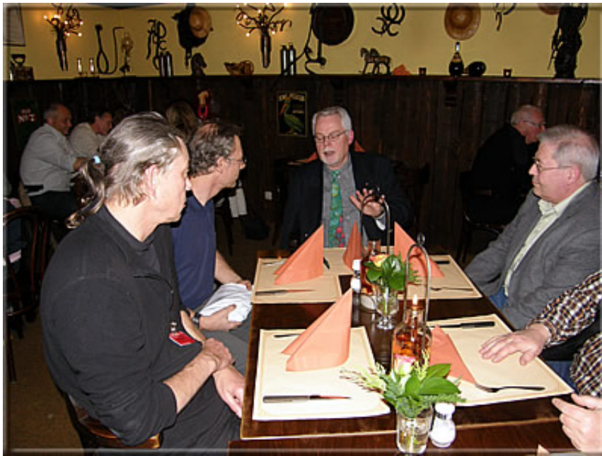
At this table the idea was born for a new Icelandic book project (to be finished in 2010) – hopefully it will not remain an idea only.