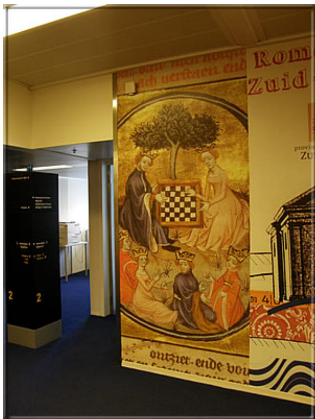
In the picture: a medieval chess motif on the wall

The majority of the chess literature is stored today in "closed" archives or stacks. It is possible to take a look partly by lending, partly only by means of microfilms.