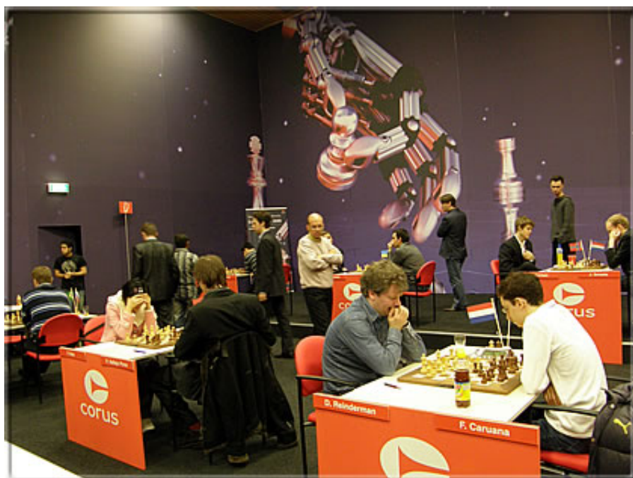
A view of the playing area