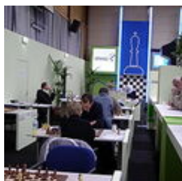
GM group C Tournament