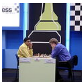
Viswanathan Anand vs Alexey Shirov