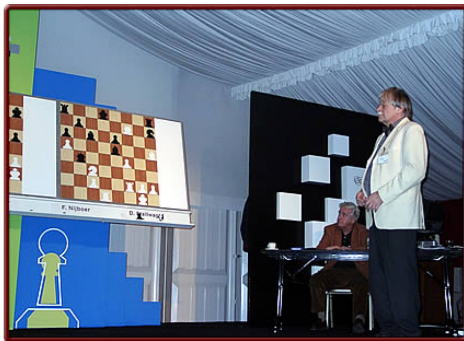
Vlastimil Hort and ...