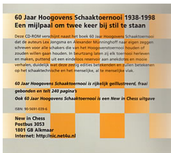
Cover of CD-ROM inside