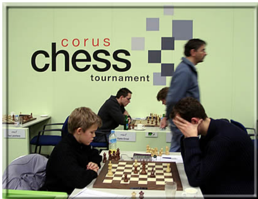
13 years old Norwegian Magnus Carlsen (the later tournament winner!) playing in the Group C Tournament