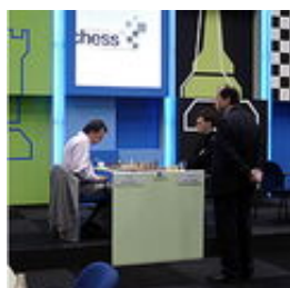
Ivan Sokolov vs Loek van Wely

The Dutch Timman-loving audience was very close to another joyous day. Reaching the time control after a nicely played game, Timman's position looked very promising, as his opponent Peter Svidler fully realized. Unfortunately, Timman was unable to calculate the complex endgame in depth and settled for a draw by repetition, much to Svidler's relief.