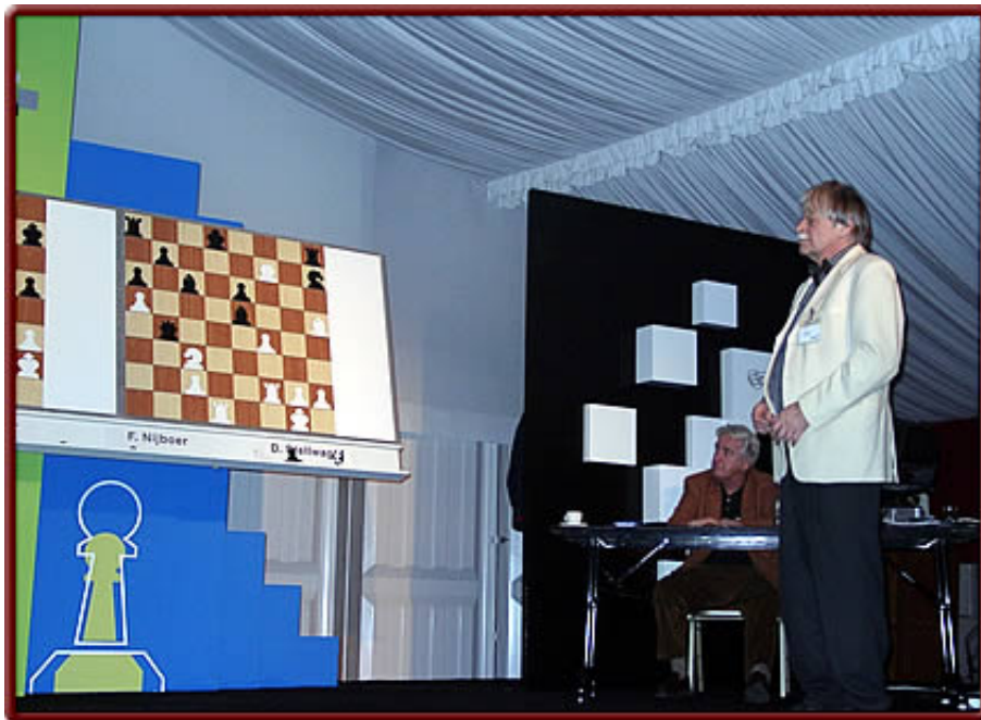
Vlastimil Hort and ...