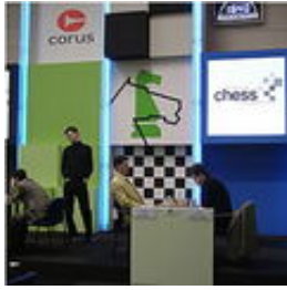
_ Peter Leko vs Vladimir Akopian