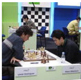
Lenier Dominguez vs Hikaru Nakamura