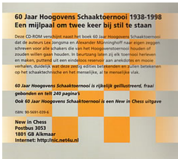
Cover of CD-ROM inside