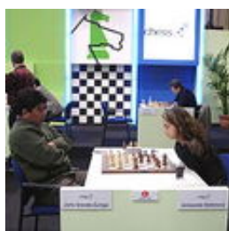
Julio Granda Zuniga vs Antoaneta Stefanova