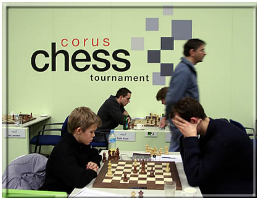
13 years old Norwegian Magnus Carlsen (the later tournament winner!) playing in the Group C Tournament