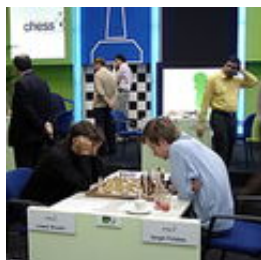
Lazaro Bruzon vs Sergei Tiviakov