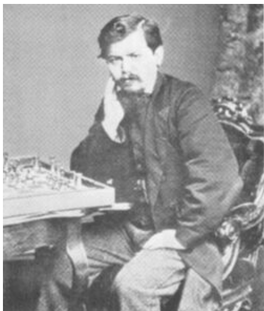
Steinitz in 1866

As expected, there are many games and biographical aspects hitherto hardly known or unknown at all; moreover, every game text is philologically analysed in order to restore the original venue, date and moves, which – after more than a century of copying and recopying – cannot at all be taken for granted even for the most celebrated encounters (rather, often especially for them).