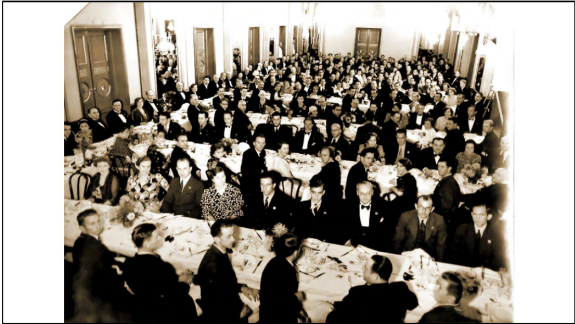
Germany rejoining FIDE. Nordics and Hungary suggested exploring this. Uruguay joined FIDE