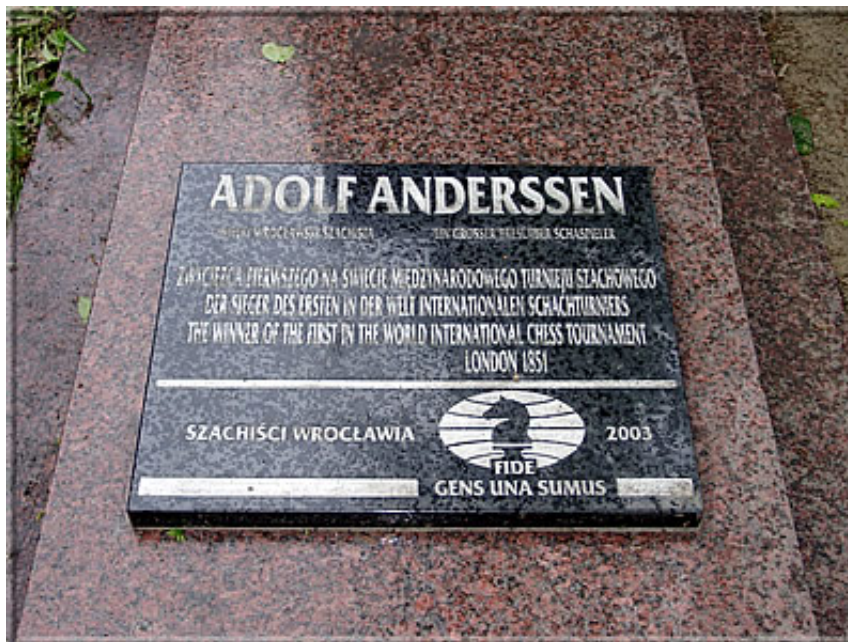
and the memorial slab