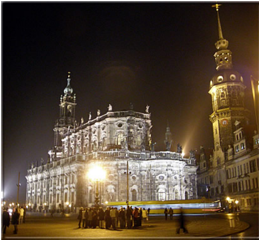
The Catholic Court