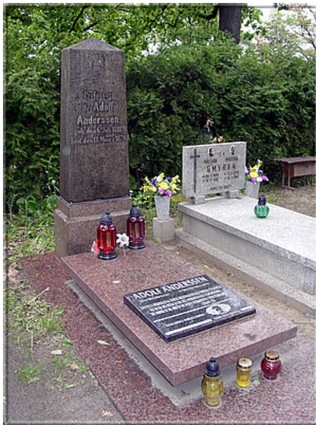
Anderssen's grave in Wrocław