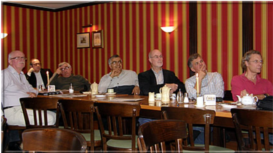
... and the other half