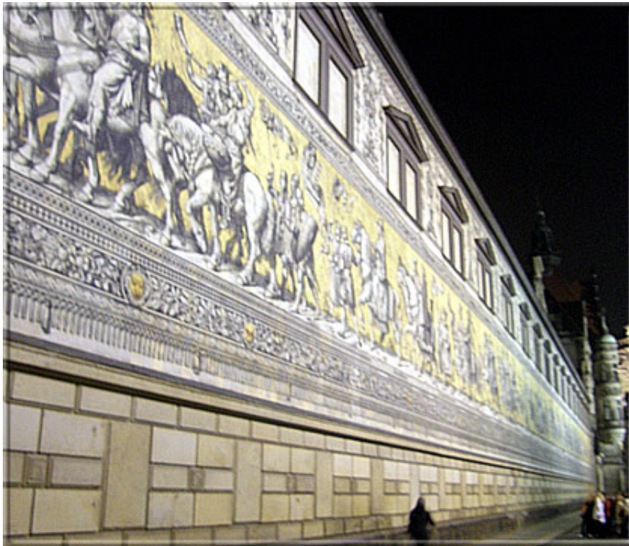
The famous "Fürstenzug"