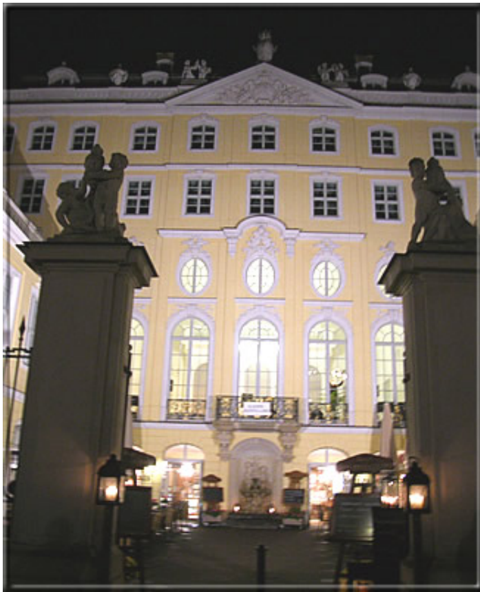
The enchanting Coselpalais – a baroque Grand Café and restaurant near the "Frauenkirche"