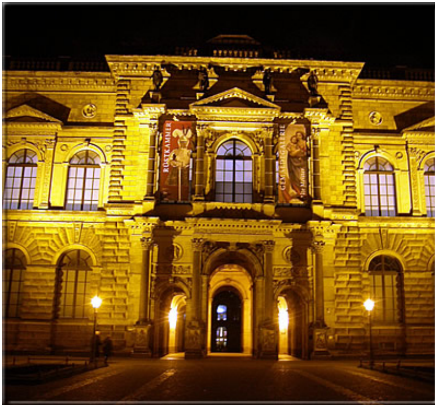
The universally known Dresden "Zwinger" (entrance) – a masterpiece of the courtly baroque – originally laid out as an orangery for August the Strong.

During the following tour of the city by bus only a small part of the numerous Dresden sights could be closely looked at. The historical monuments of the old part of Dresden were the centre of attention, they are partly lit with light at this time and therefore have a very impressive effect even on dull November evenings – the small photo selection below may roughly show that.