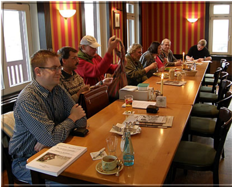
The one half of the audience ...