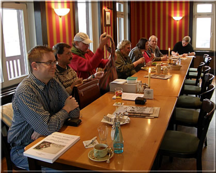
The one half of the audience ...