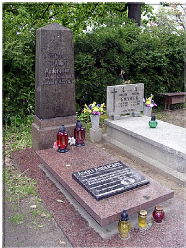
Anderssen's grave in Wrocław

You may read his lecture word for word in this pdf file (in German only), the Anderssen memorabilia presented (from his own stock) are accessible in this picture gallery .