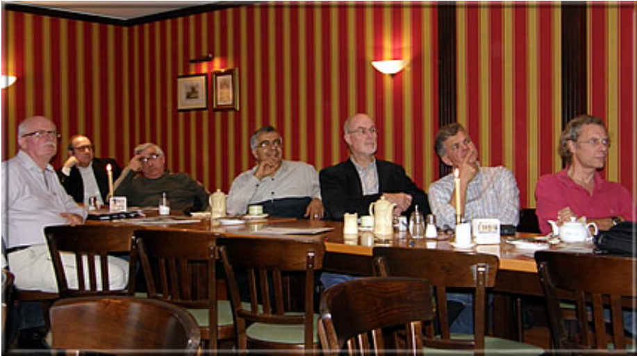
... and the other half