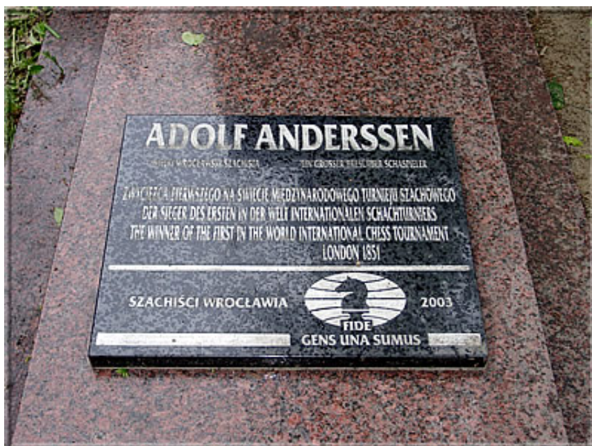
and the memorial slab