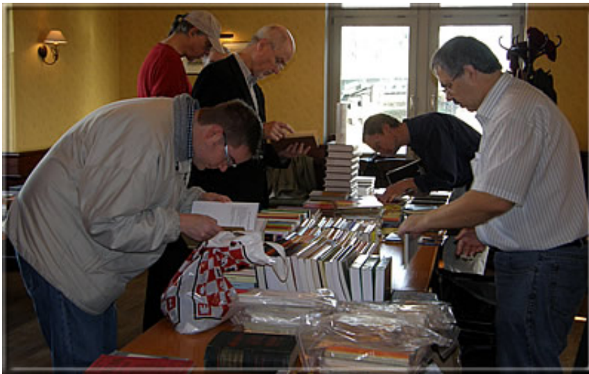
The book market in the Bridge Room of the SchillerGarten – for each (chess) taste there was something available.