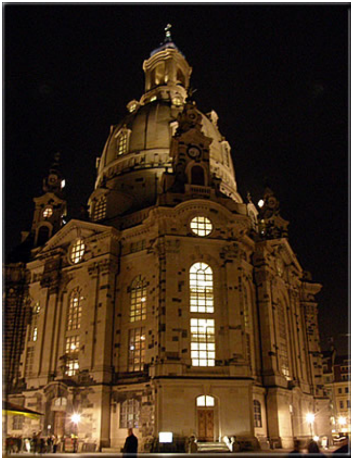
The “Frauenkirche” belongs to the most famous symbols of Dresden. Its rebuilding was completed in 2004.

You will find a series of additional photos – also of the three Elbe castles on the right side of the Elbe (Albrechtsberg Castle, Lingner Castle and Eckberg Castle) – in the following picture gallery (17 photos).