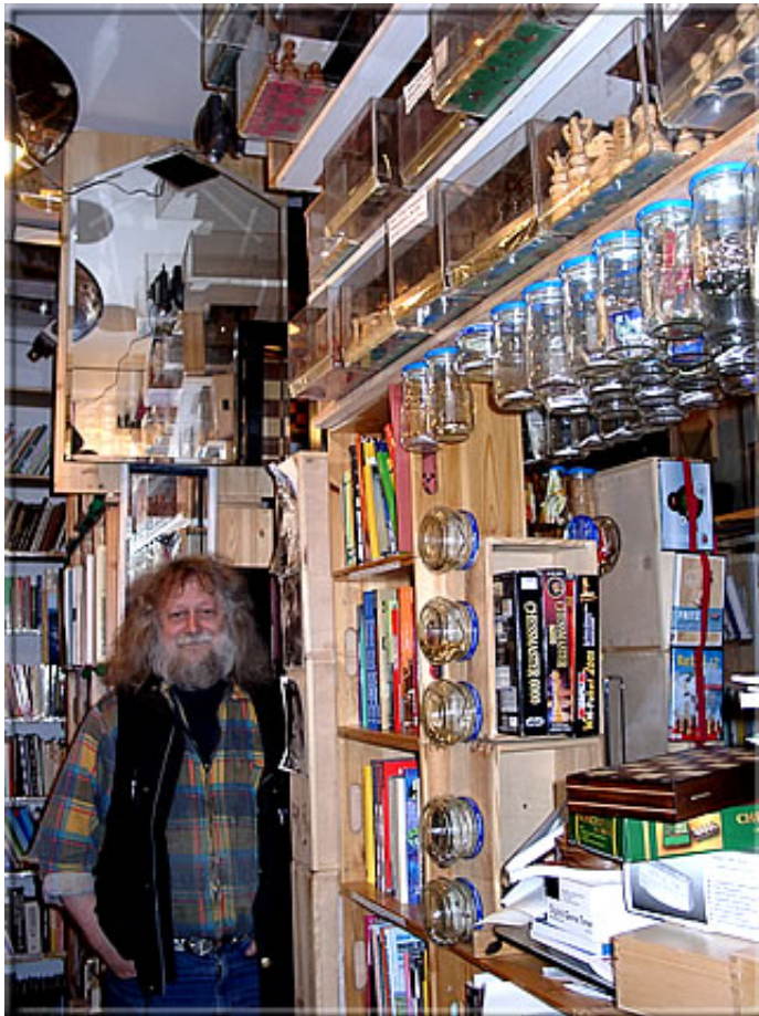
At Ralf-Axel Simon in Berlin-Steglitz you can wonderfully rummage for chess literature as well.