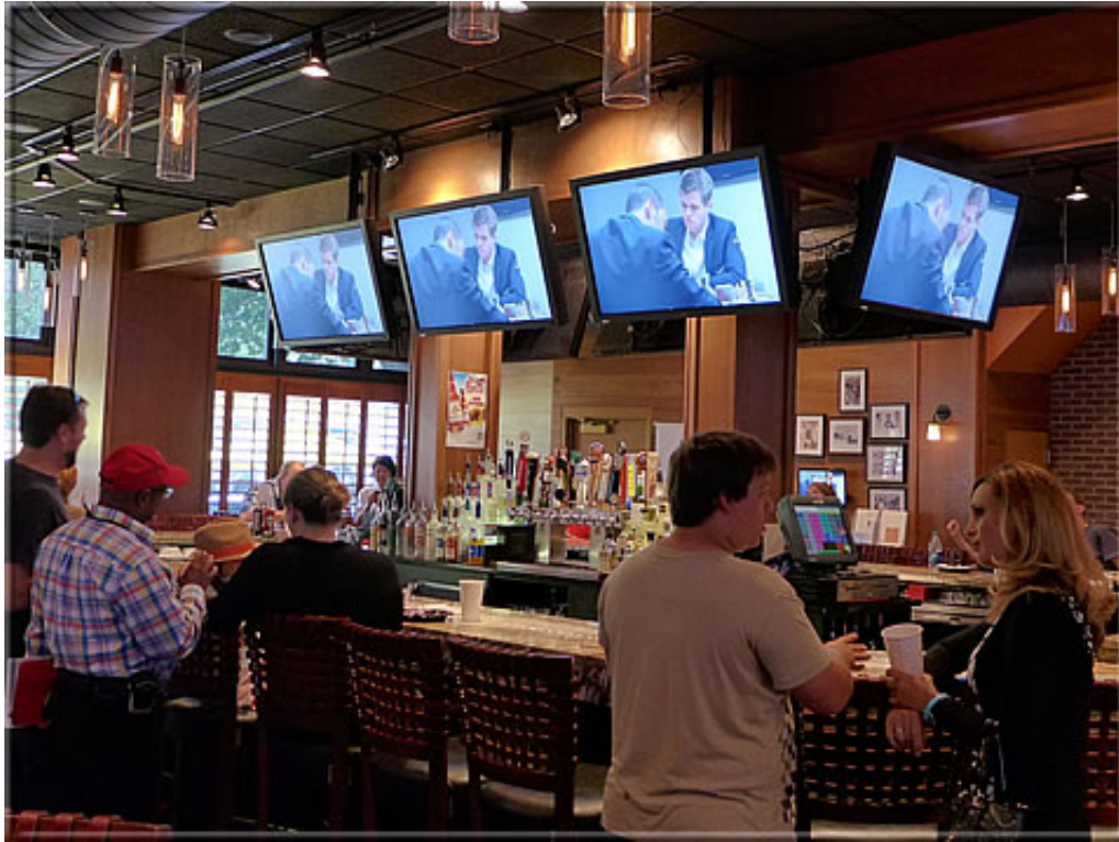
"American way of chess" in Lester's Bar ...