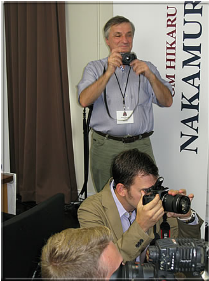
The German press photographer