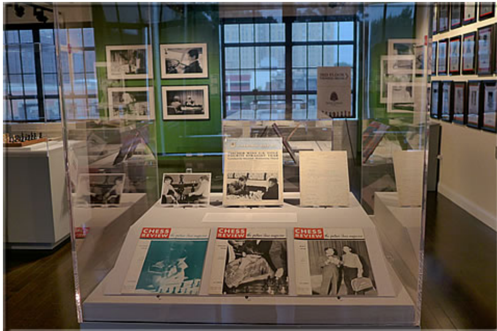
Some Bobby Fischer memorabilia