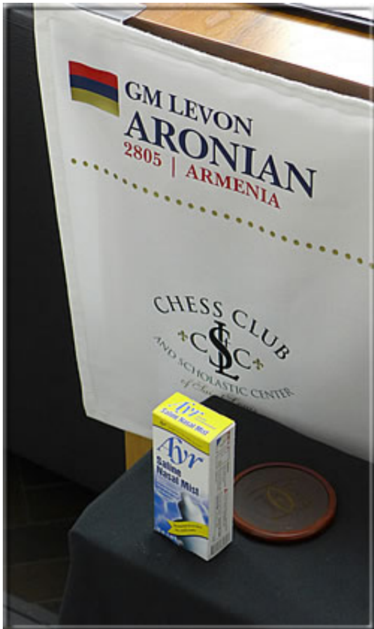
... Saline Nasal Mist