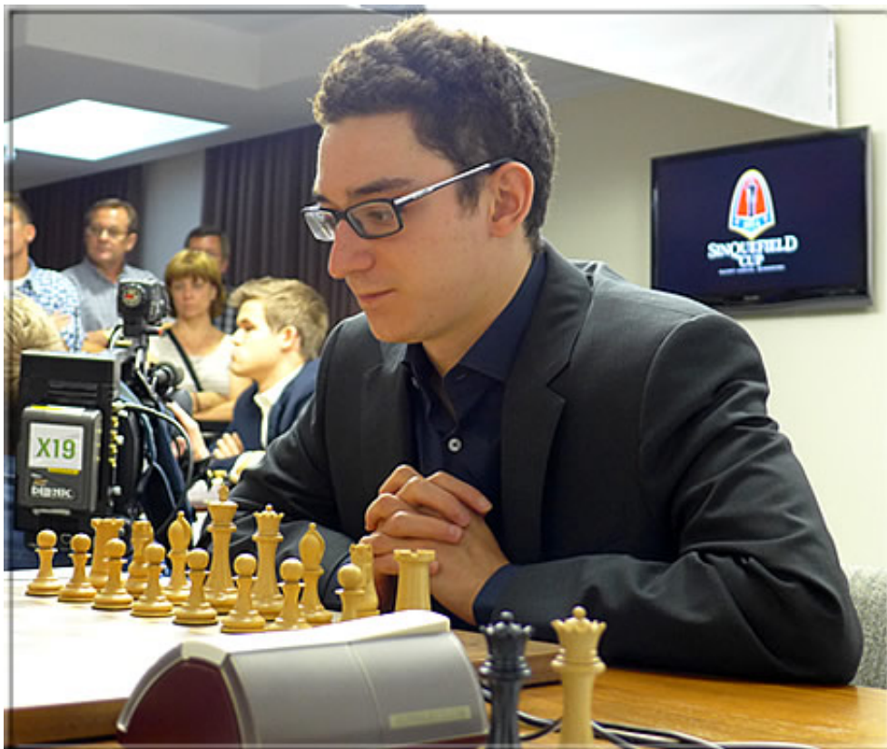
Again a "Fabulous

At the start of the second tournament cycle the only question was if somebody could stop Caruana. Obviously this was not possible. In the sixth round he defeated Topalov in 31 moves, extending his lead over Carlsen to 3 points! The latter couldn't exploit a nearly won position against MVL.