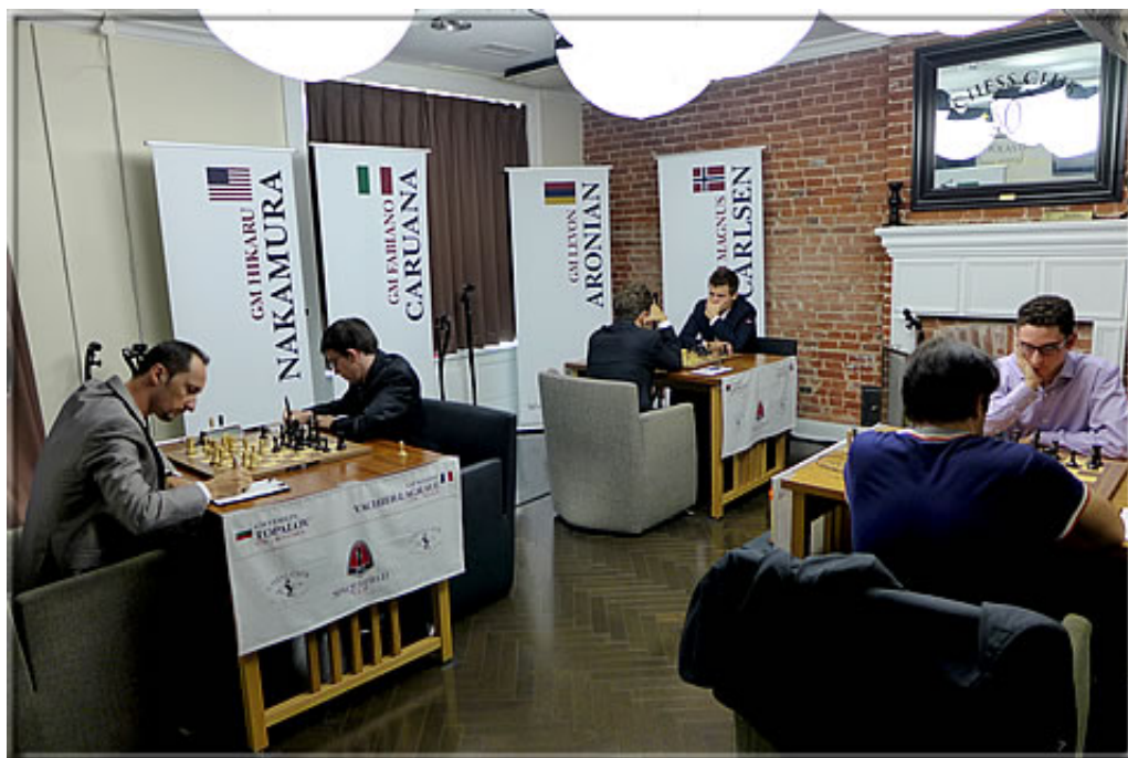
The tournament is up and running (photo of round 5). The spectators crowded 1 m to the right of the photo – it was a Sunday.