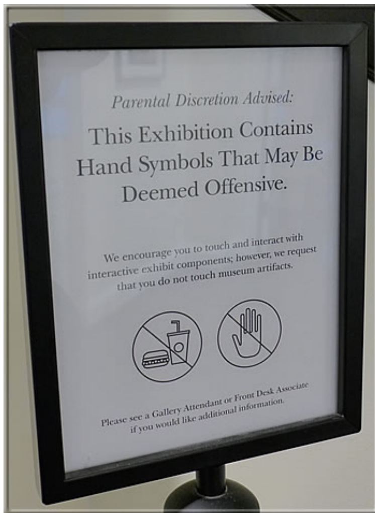
A sign warning of an artistic chess set (see below)