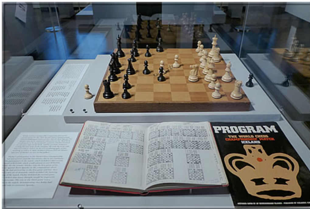
A chess board signed by Bobby Fischer and the Wildhagen "Red Book" on Boris Spassky (flipped open)