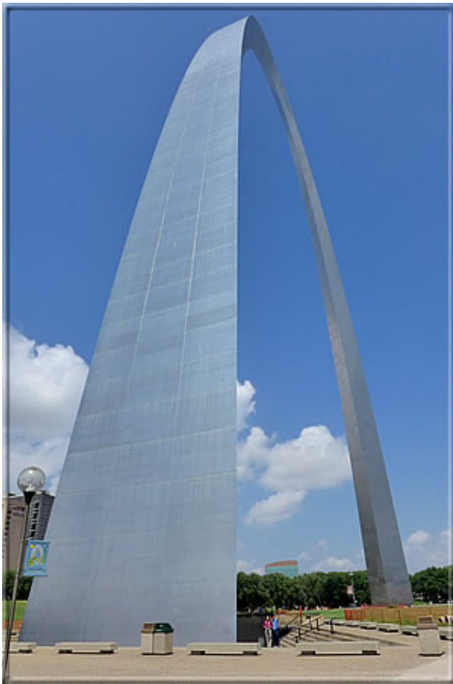
Gateway Arch – famous monument of St. Louis symbolizing the westward expansion of the United States

We had covered the 300 miles from Chicago O'Hare southwestwards by a rental car – the Dodge , the condition of the Interstate 55 and particularly a veritable thunder cell (fearing a tornado) had worried us a little, so we were happy to reach – after passing the Mississippi – the luxury Chase Park Plaza Hotel where the six tournament participants had also found accommodation.