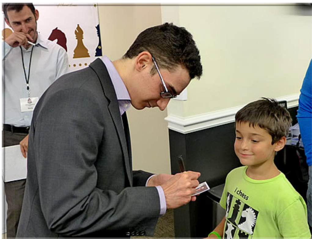
A happy boy - Fabiano Caruana signs autographs.