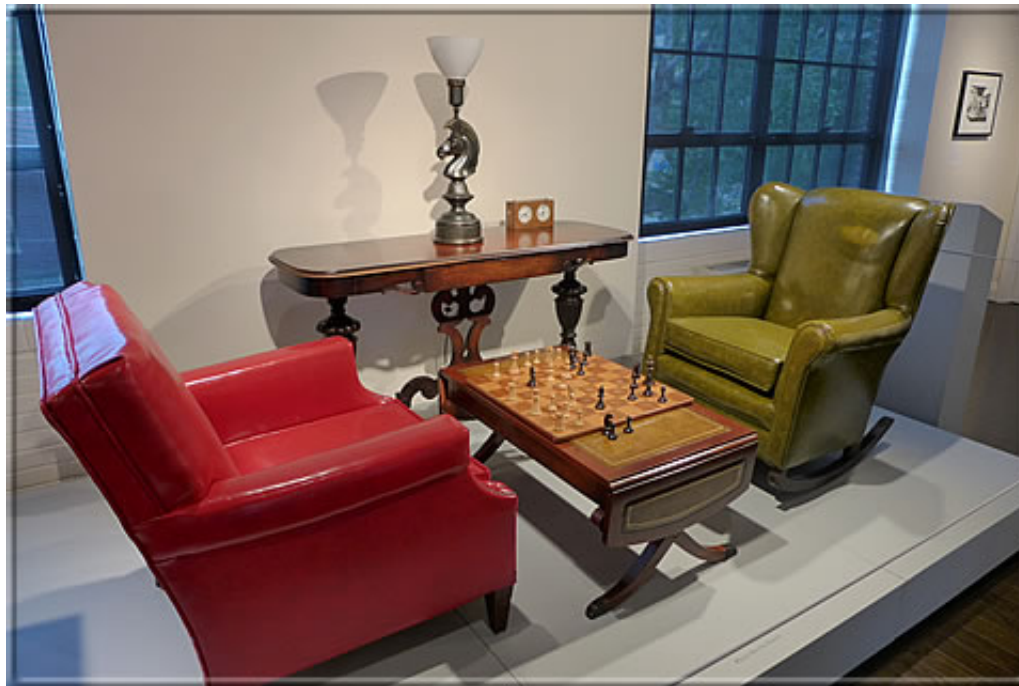
Bobby Fischer used to play on this furniture in his youth.