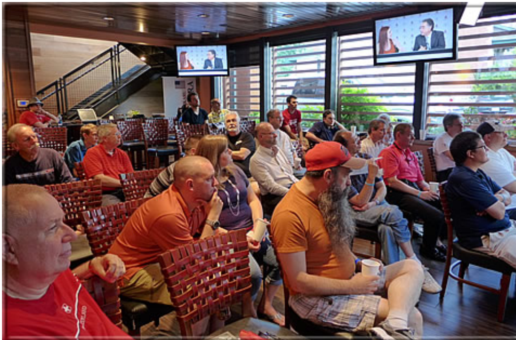
Spectators in the commentators room.

This third round (on 29 th of August) should give direction to the whole tournament. The ailing and indisposed Levon Aronian was outplayed by MVL (Maxime Vachier-Lagrave) – the start of a "long castling" 0-0-0 to be followed by draws only in the second cycle. Hikaru Nakamura missed a big chance to inflict the third defeat in a row on Veselin Topalov, and in the game of the day, Carlsen vs. Caruana, the world champ overlooked a rook check he had seen a few moves before, hence he had to give up some moves later.