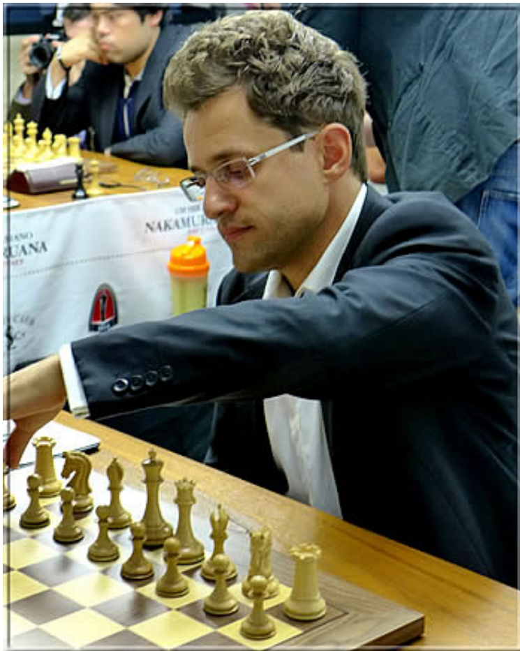
Levon Aronian and his medicine ...