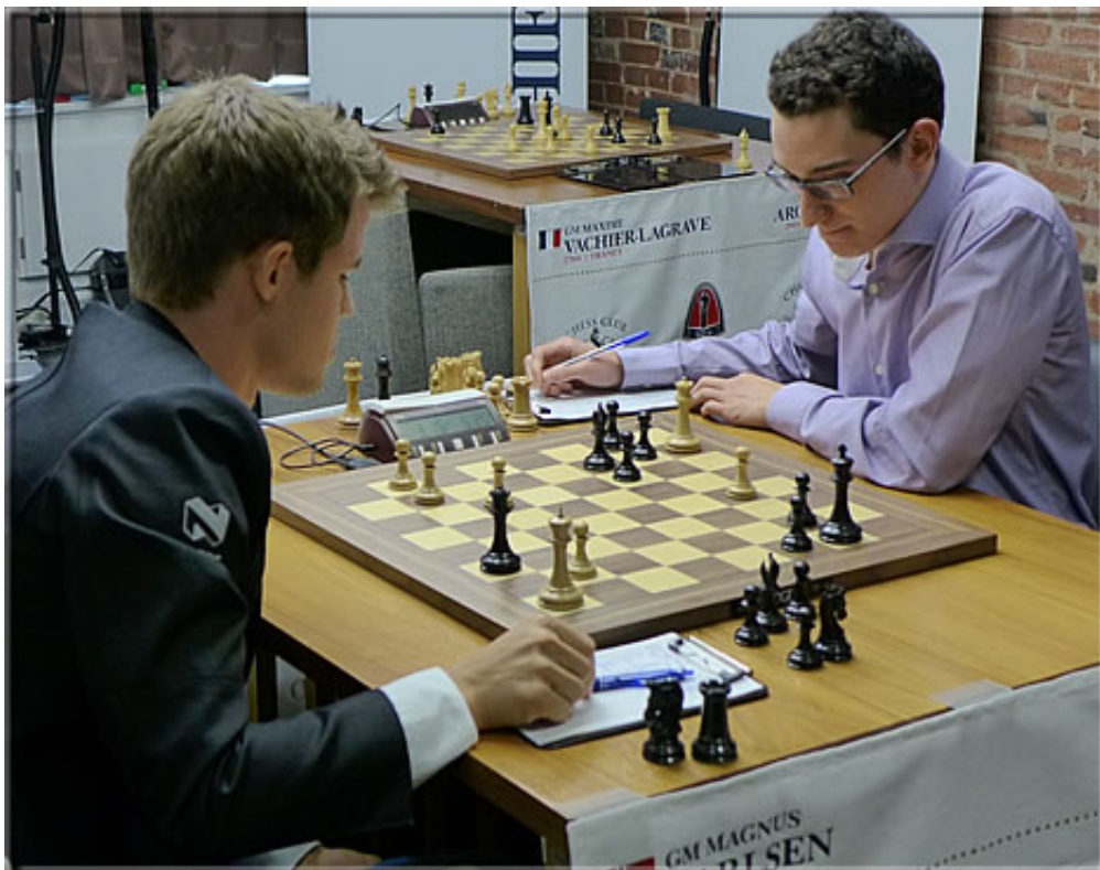
Still one move –