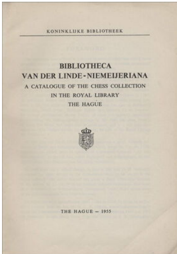
LN - Bibliotheca van der Linde - Niemeijeriana, The Hague 1955