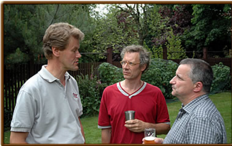
Board members by themselves: