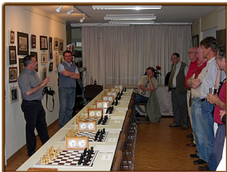
Instructions just before the start – a clock simul requires "discipline"!

The well-known International Master Bernd Schneider from Solingen (current FIDE-ELO 2427) was willing to play a clock simul on 12 boards (90/90) – surely a quite demanding challenge. As Bernd told me later on the playing strength of the participants was nearly a bit too high, but in spite of some difficult positions the master succeeded in achieving a notable 9,5 – 2,5.