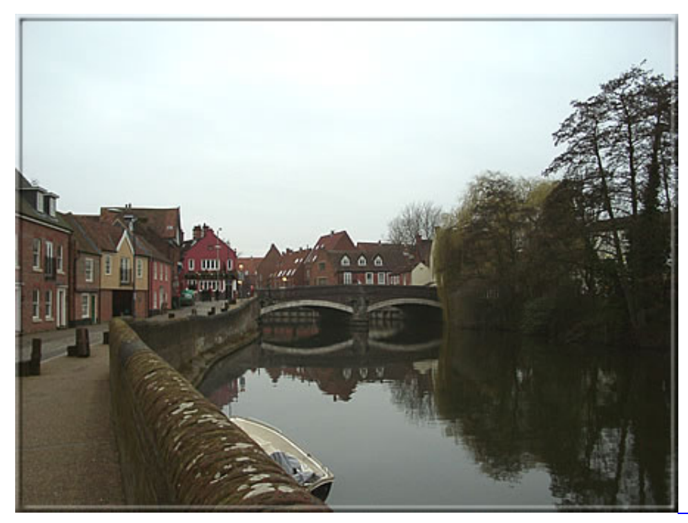
In Norwich - Norfolk's

On the photo below you can see the river Wensum flowing through the really very impressive historic centre of Norwich. In the Middle Ages the latter was the second largest English town, today it's more province in Norfolk. Cromer is located 40 km to the east, directly at the North Sea coast. Certainly there will be again an opportunity for a visit in future.