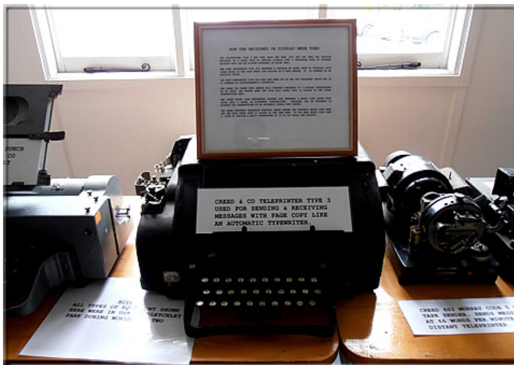
Technical exhibits in Hugh Alexander's room (Middle: CREED & CO TELEPRINTER TYPE 3 USED FOR SENDING & RECEIVING MESSAGES WITH PAGE COPY LIKE AN AUTOMATIC TYPEWRITER)