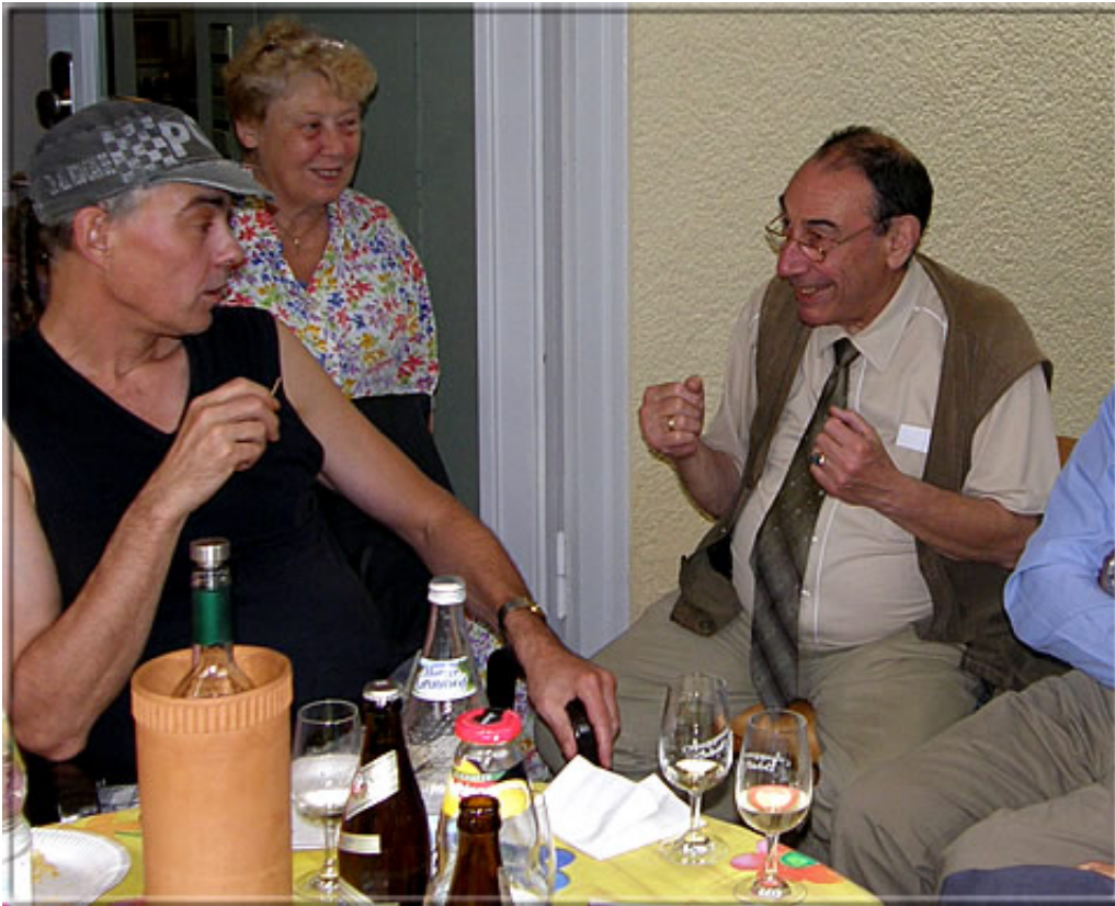
Our hosts in