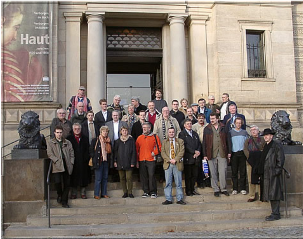
Group photo in front of the Duke August Library (November 2003)