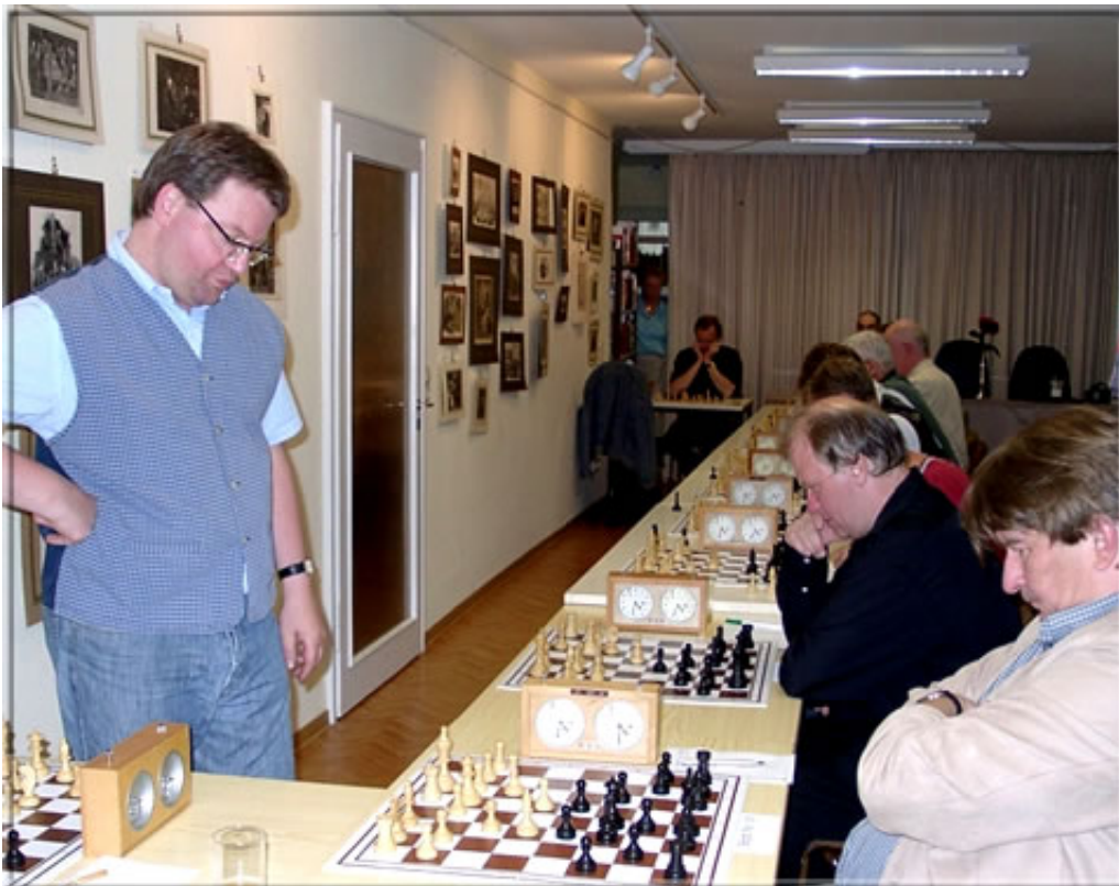
... and a clock