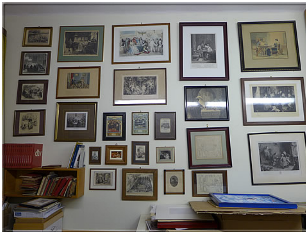
Chess graphics and paintings

A (very limited) selection of further photos in this gallery .