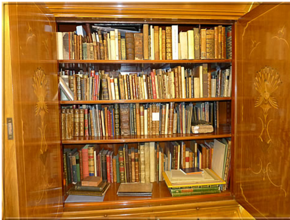
The most valuable treasures in a wall closet in Lothar Schmid's former study