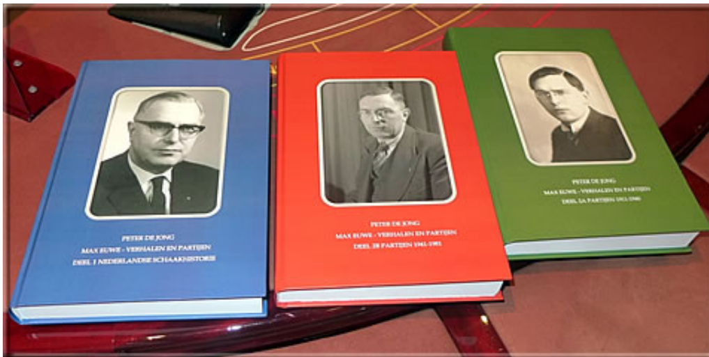
The new Euwe