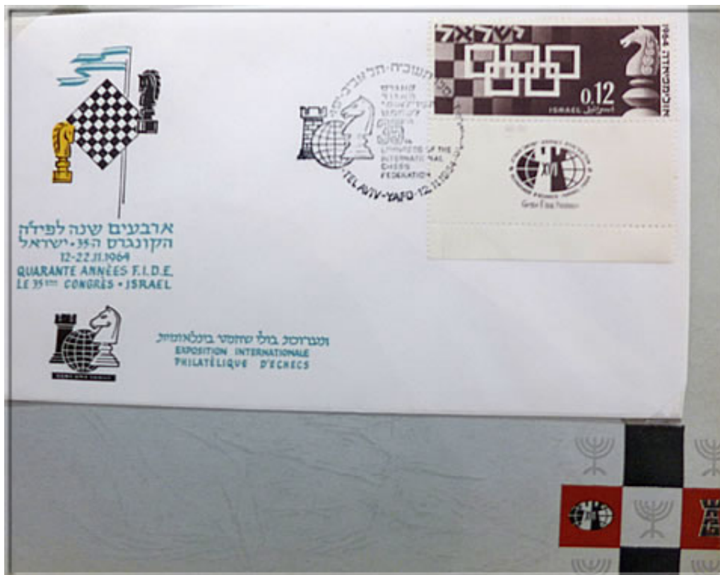
Price for the best players - special issue cover and stamp on the occasion of the Chess Olympiad 1964