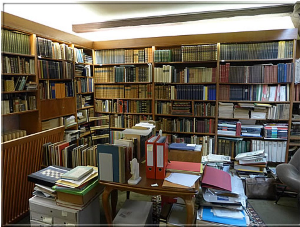
A view of the main room of the library