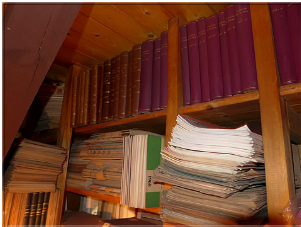
One corner in the attic (with a run of the Tidskrift for Schack )