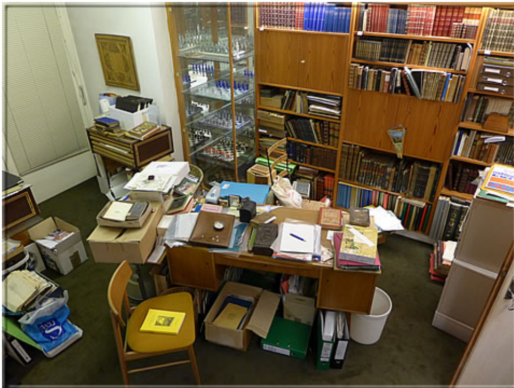
... and another view from above

Anyway, a former system is almost not perceptible anymore, and there is an urgent need for action especially on the top floor (attic) which has to be cleared of structural load. In Michael's view it seems impossible to keep the complete collection together. So the core of the collection (items until 1945, with the documents, autographs and photos) could be hopefully included in a public library. Chess graphics, chess sets and other memorabilia in the rooms downstairs should be disposed in order to gain some space for those items, to be cleaned and recorded. A further part of the collection (dated after 1945) could pass