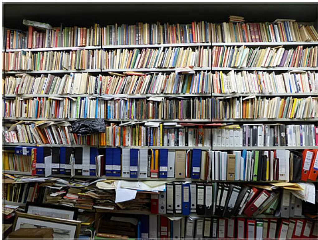
Shelf units filled with tournament and match books