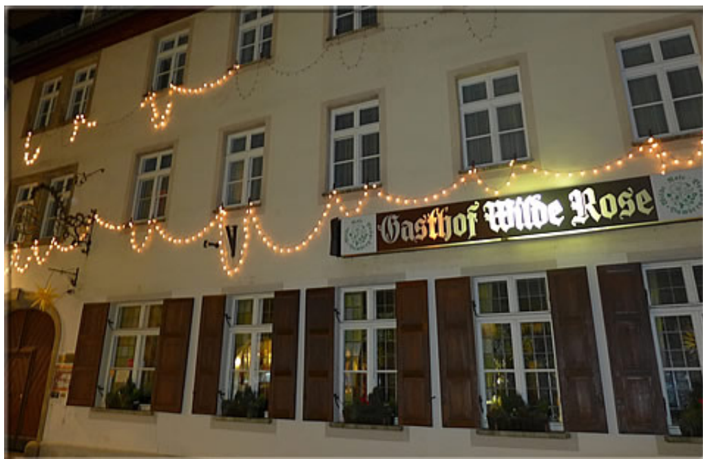
... and the Restaurant "Wilde Rose" the first home of the Bamberg chess club.