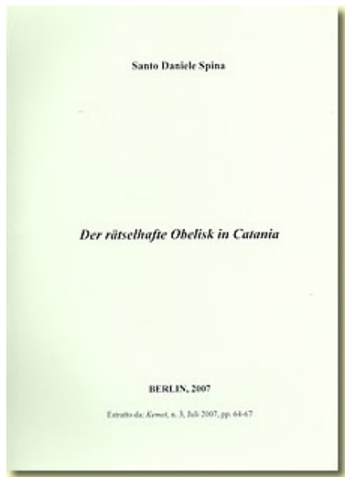
Der rätselhafte Obelisk in Catania (Berlin, 2007)