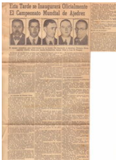
Chronicle of the newspaper La Prensa of the opening of the tournament