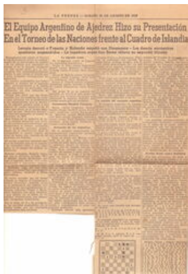
— Argentina's victory over Iceland on the opening date, La Prensa newspaper