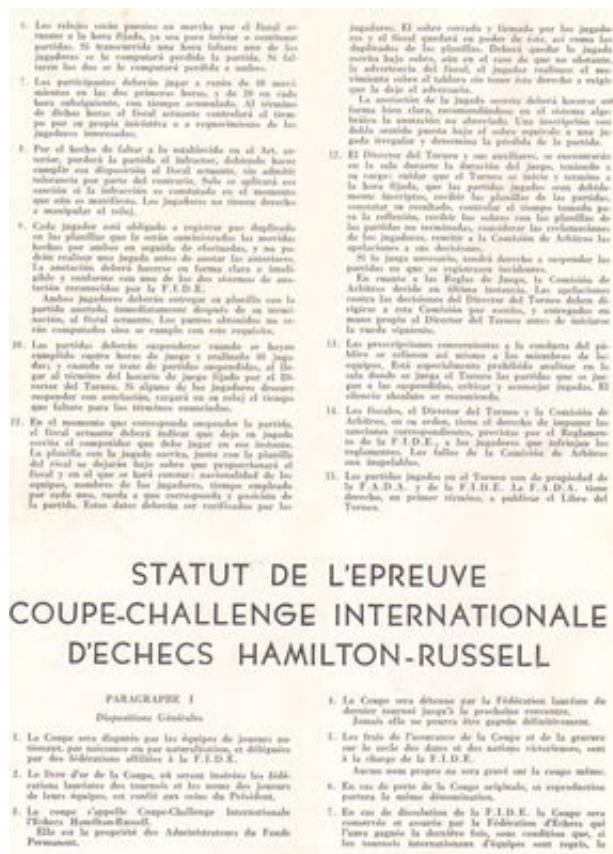
— Tournament of Nations regulations, published in