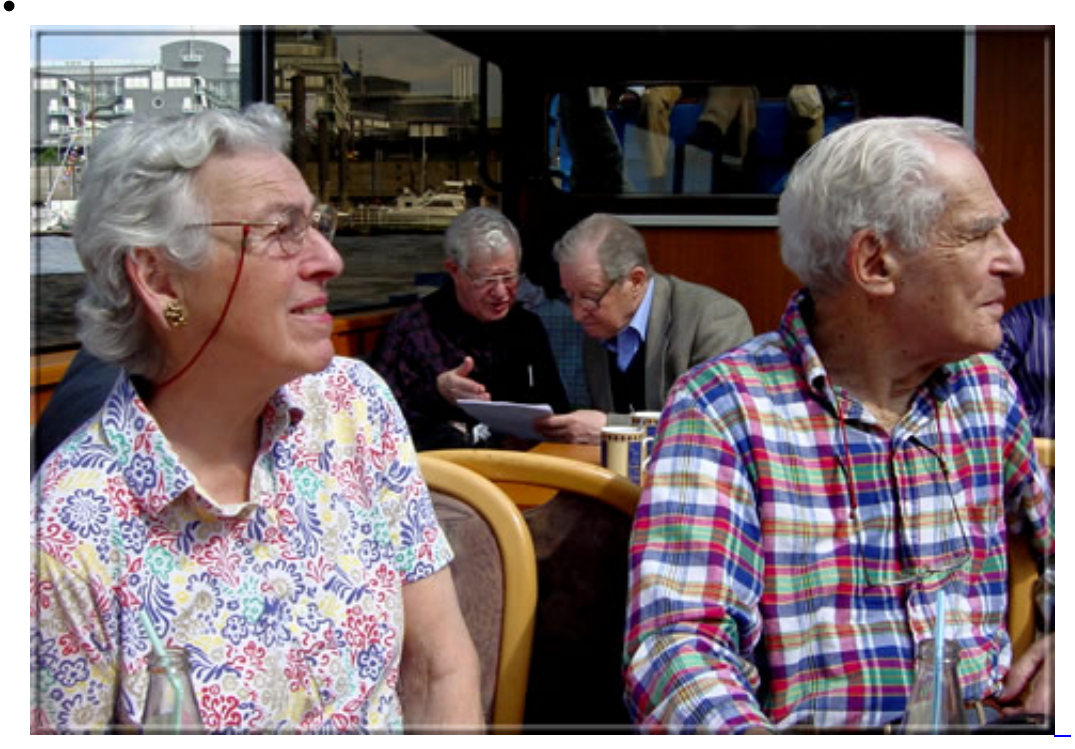
_ Photographed in