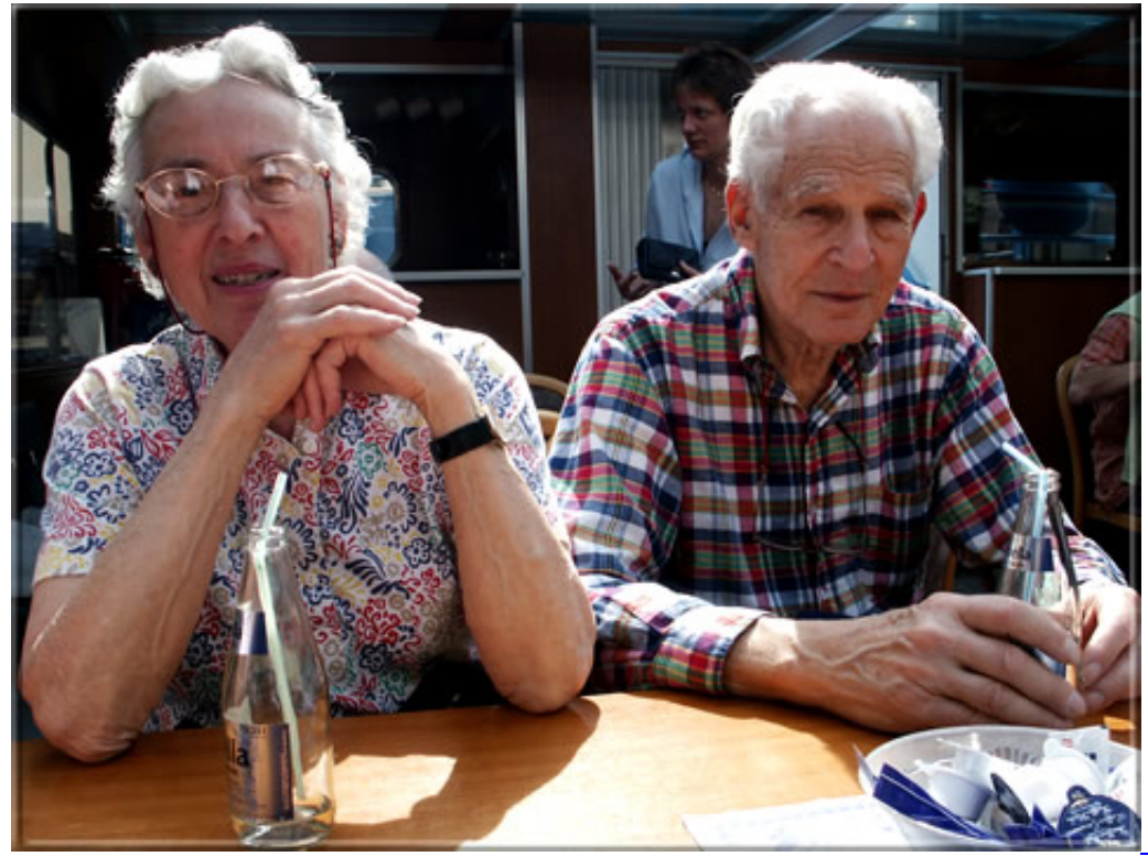
_ In Hamburg,