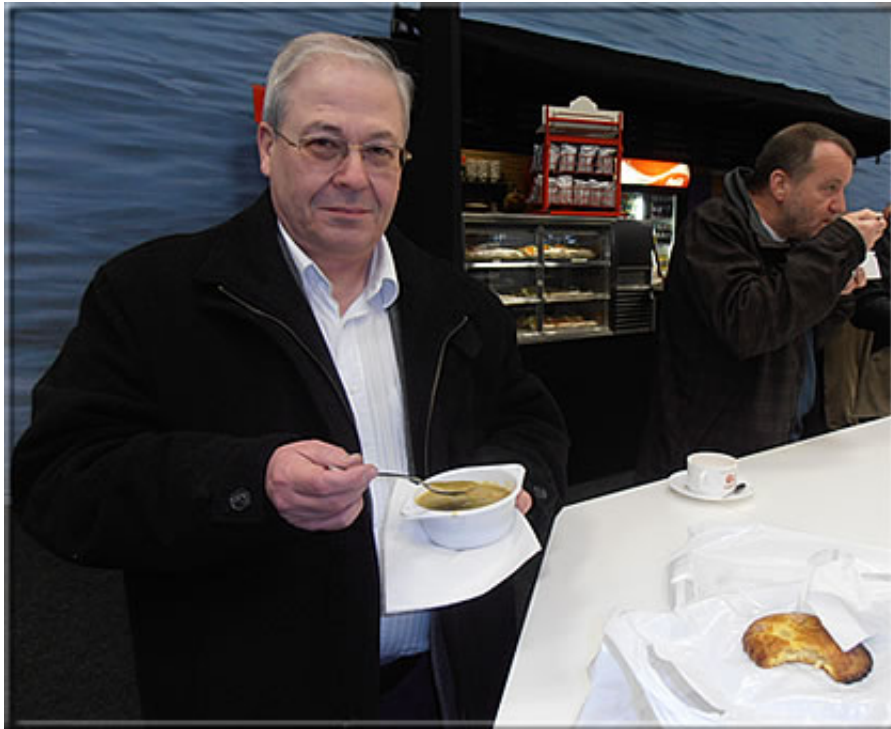
In the tournament hall: Pea soup

Also the following Monday the glorious winter weather with bright sunshine continued. This picture gallery offers a selection of photos from some stops on the way from Zandvoort to Wijk, from a walking-tour through the dunes of Wijk as well as from the third round of the tournament which we had to leave early for the journey home.