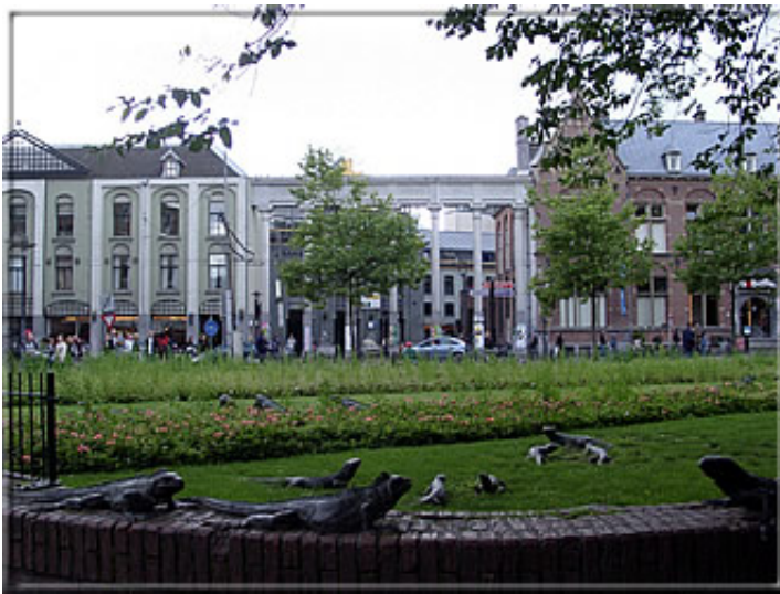
Back view of the MEC.