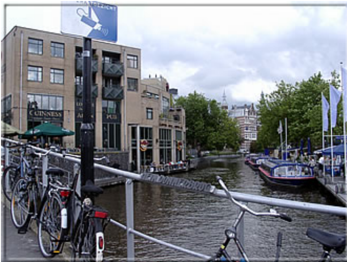
View from the Hein Donner-Bridge (named after the Dutch GM). It's not far away from the MEC now.