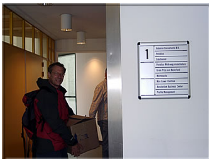
To reach the innermost of the MEC you have to pass several doors, this is the first one ... By means of a lift you may effortlessly move upward to the 1st floor.