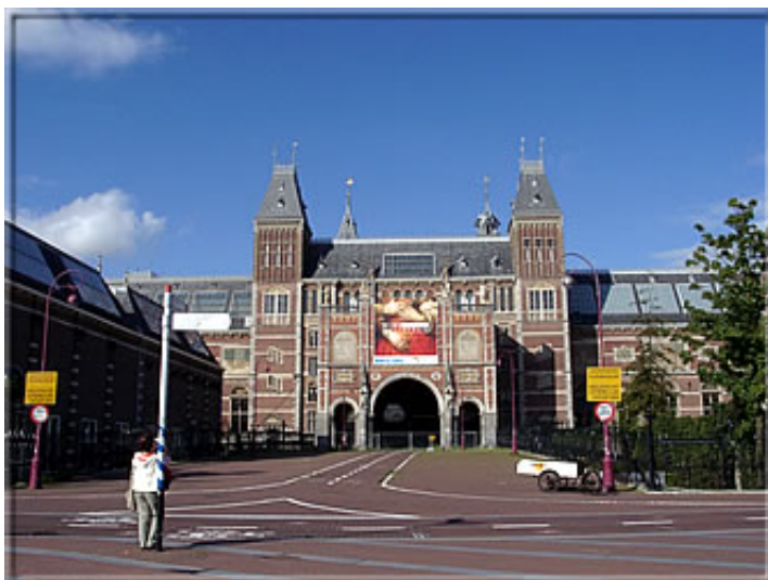
The Rijksmuseum from the rear, only a few minutes to go from the club seat.