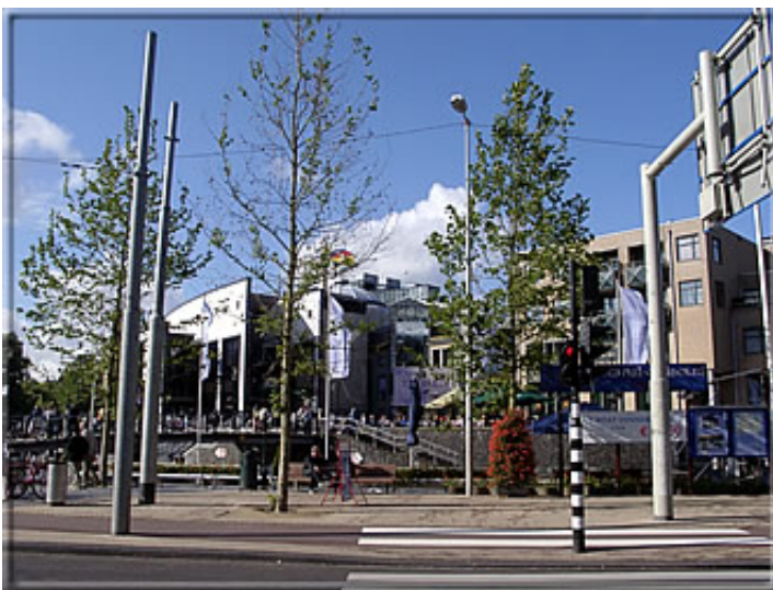
The Max Euwe-Centrum comes into sight!