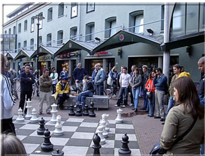
must be a crowd puller in Holland!