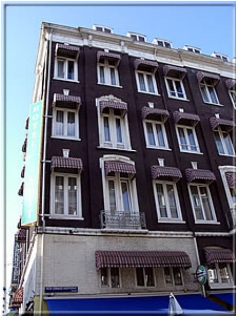
The Hotel Smits, for several members the accommodation of their choice during the meeting in the middle of September.