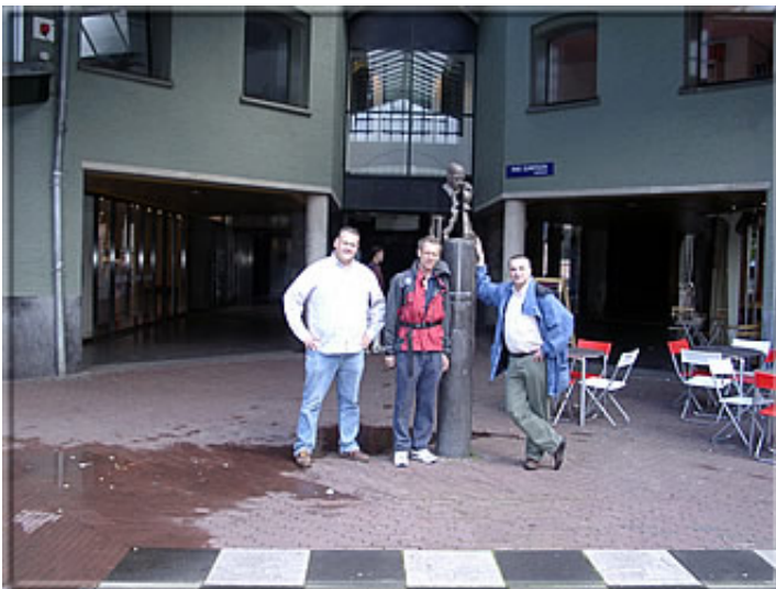
Negele on the otherwise empty Max Euweplein.