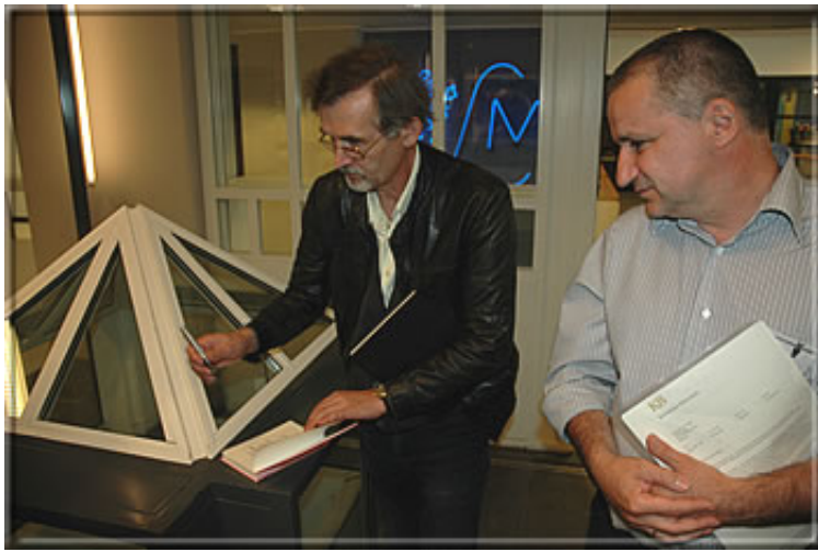
The author is signing his work ...