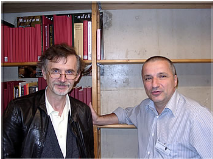
the archives! (in the top middle)