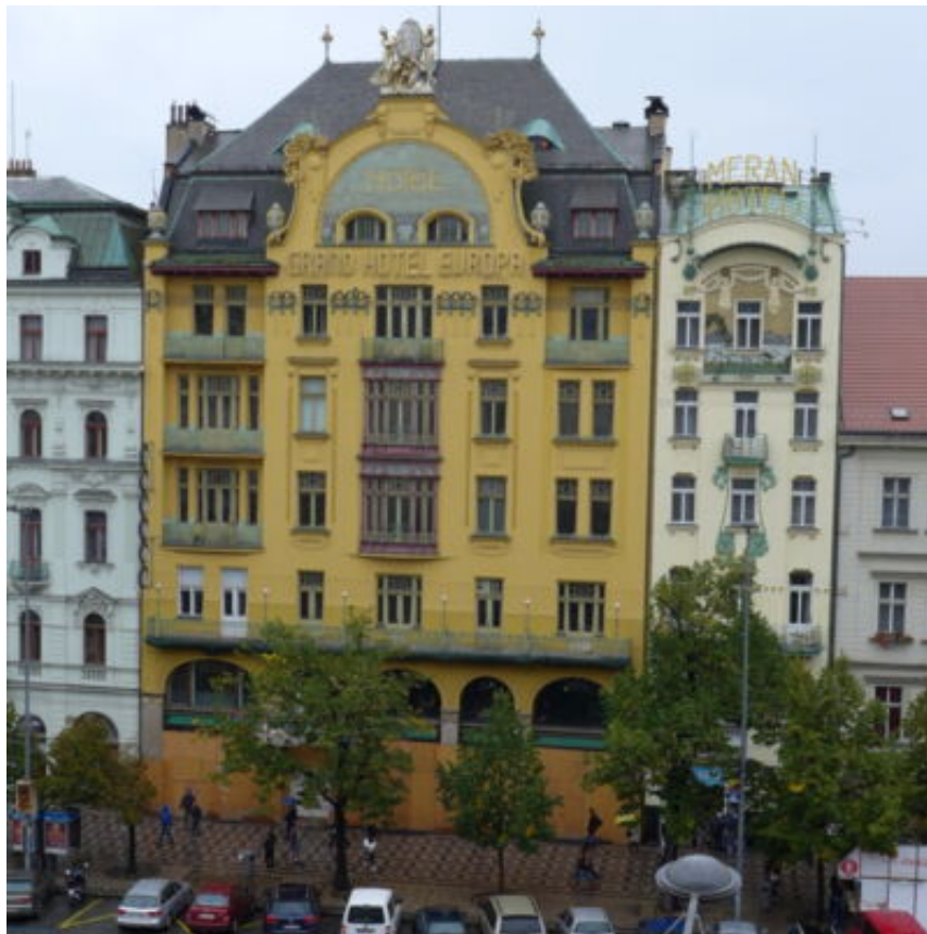
Michael Negele Grand Hotel Europa, Prague 2015