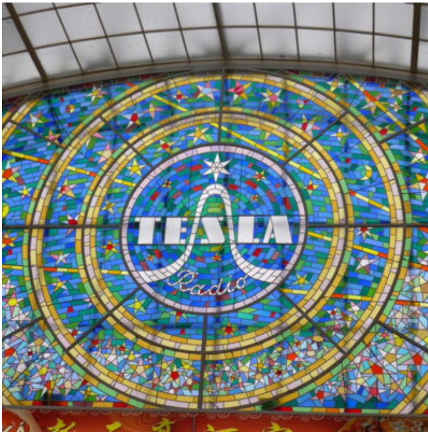
Stained glass with logo of Tesla Radio in Pasáž Světlozor, Prague 2015