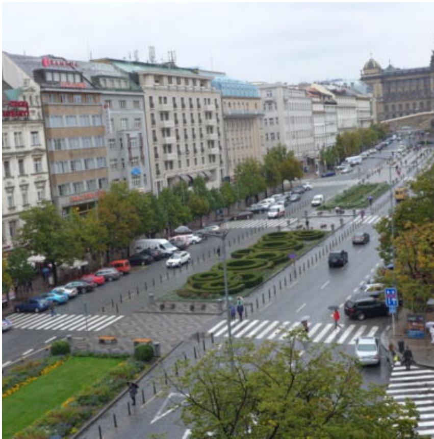
Michael Negele View over Wenceslas Square, Prague 2015