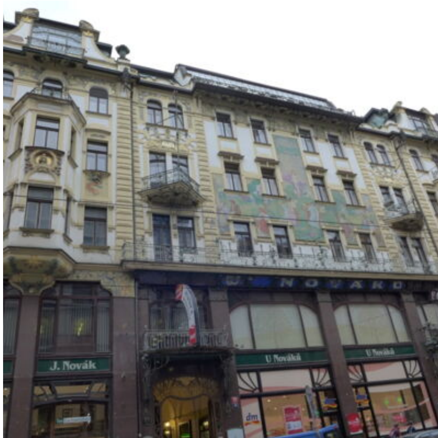
Dům U Nováků, home of the 4th Chess Olympiad 1931, Prague 2015