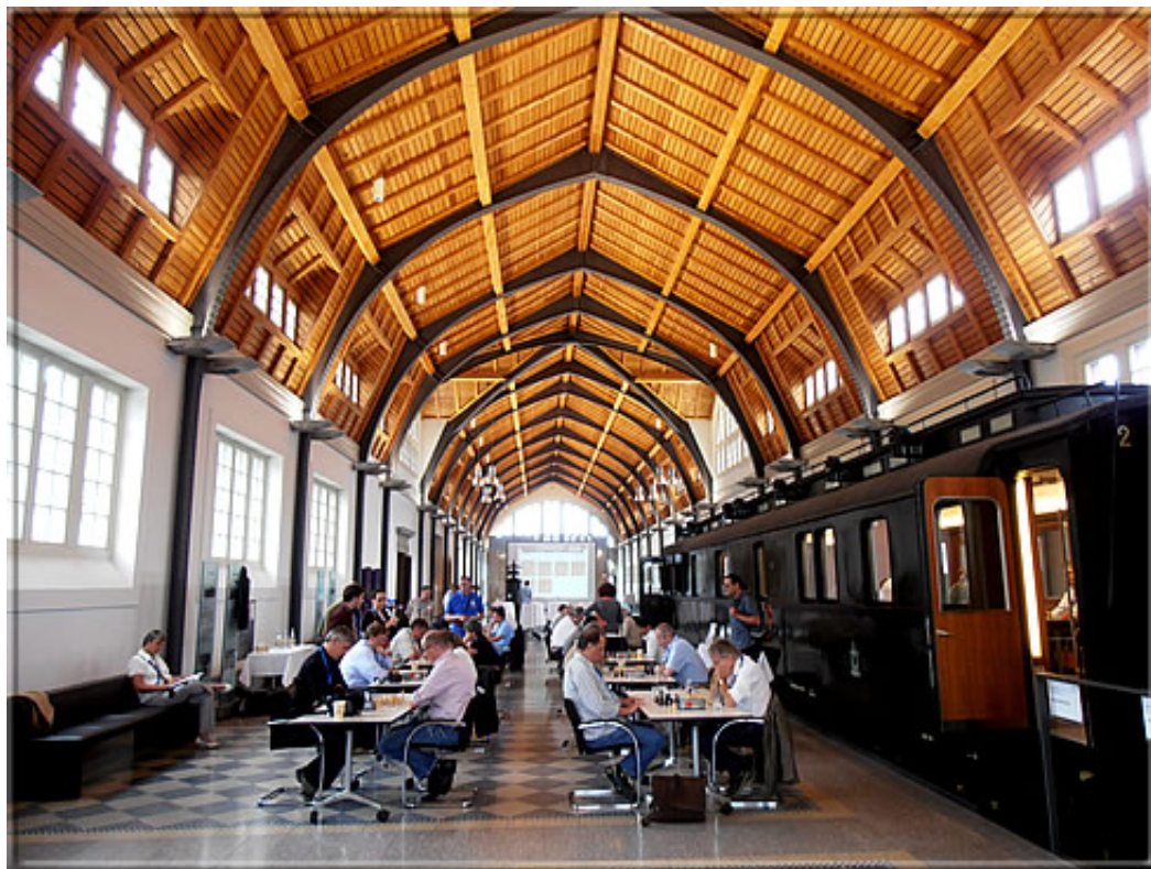
The rapid team tournament where several occupation groups competed.