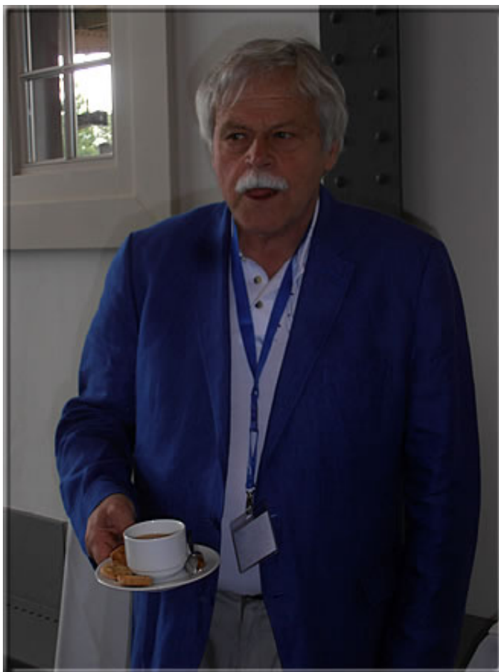
Vlastimil Hort who competed against "seeing" German chess talents in a leapfrog blindfold display.