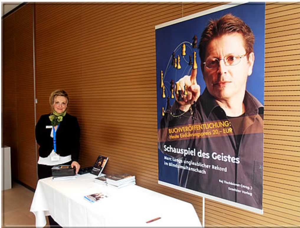
Schauspiel des Geistes at a preferential price of 20 €.