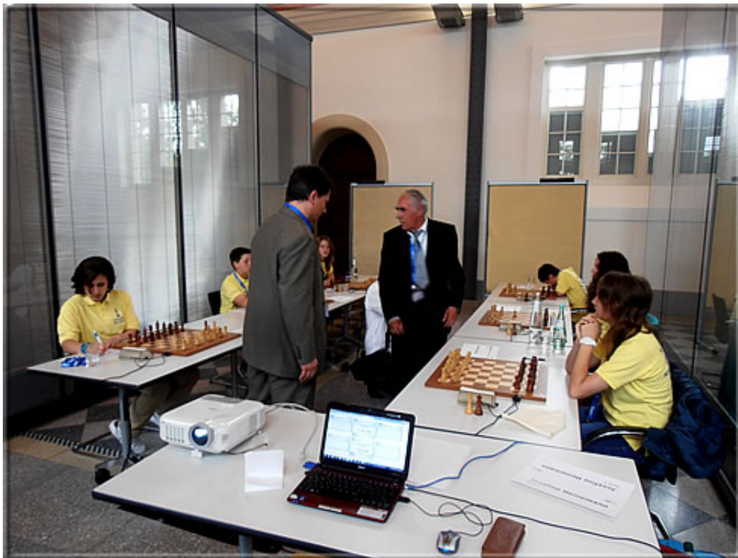
The "poor Yellows" had a hard time with the "blind" masters and lost 4 out of 6 games, with 2 draws only.

You can play through all games at http://sdg2012.liveschach.net/ .