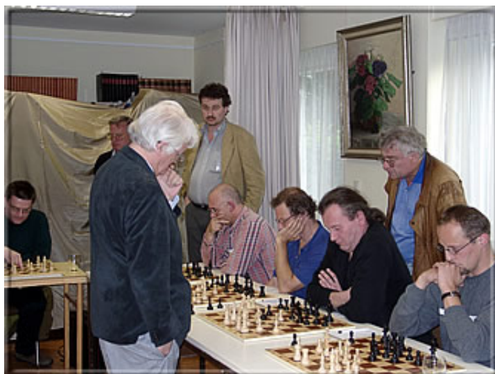
Simul Lothar Schmid on June 22, 2001 in the auction hall