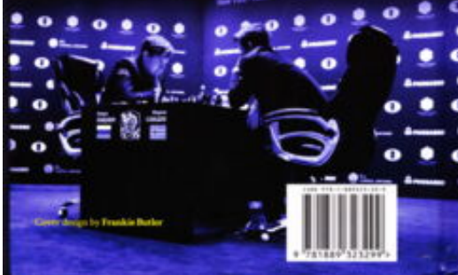
Carlsen vs. Karjakin - back cover

World Chess Championship 2014 New York - Copenhagen 11-26