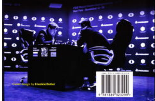
Carlsen vs. Karjakin - back cover