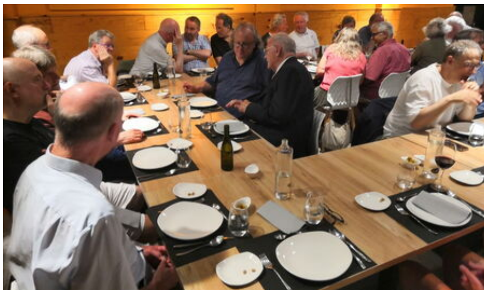
Lively conversations over dinner together