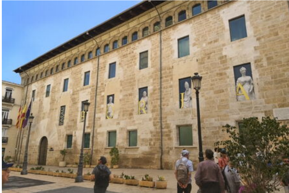
The Palace of the Borgia in Valencia.