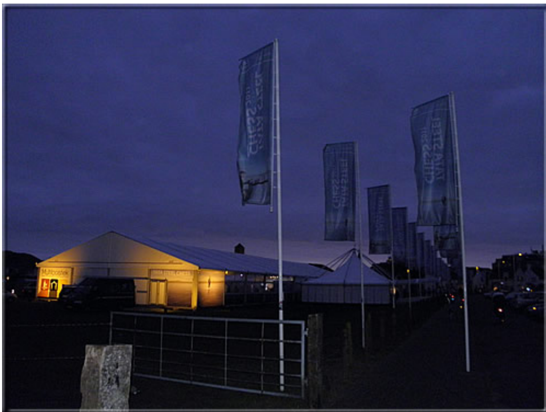
The Pavilion at eventide