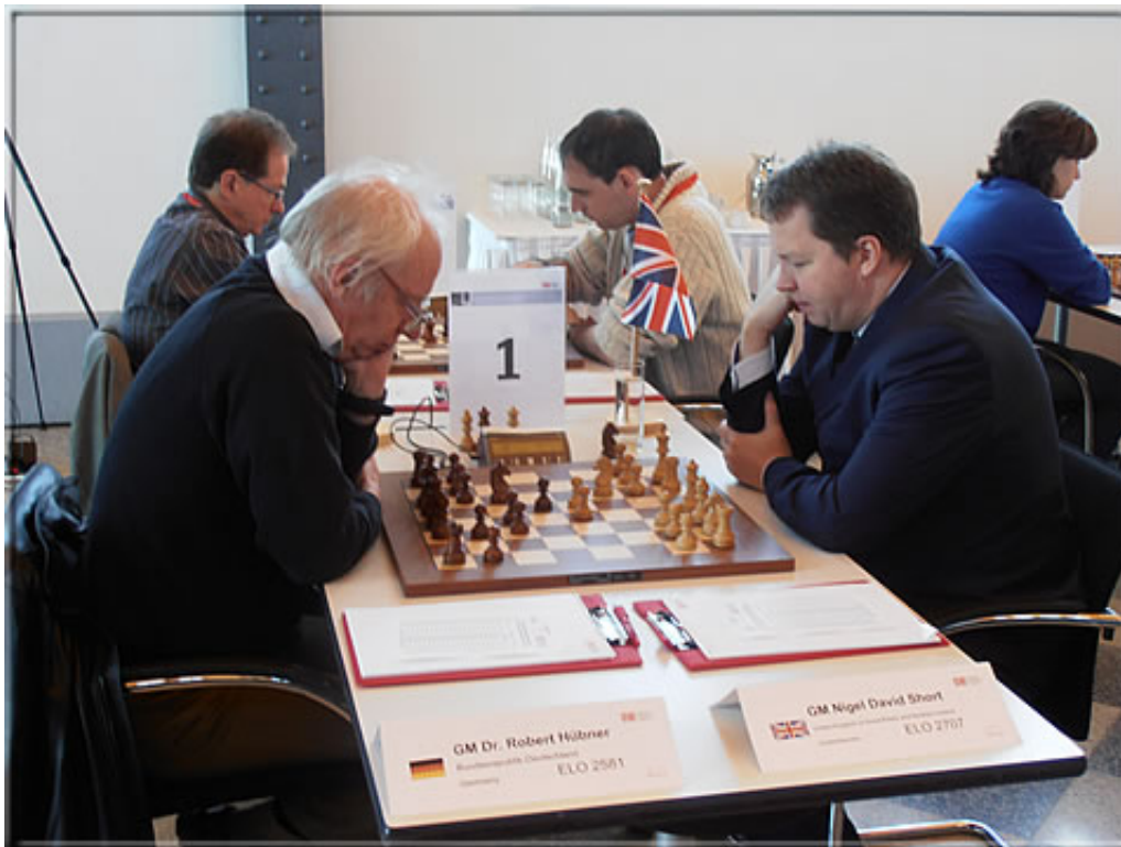
In round 6

Robert Hübner unfortunately lost with the black pieces against Nigel Short.