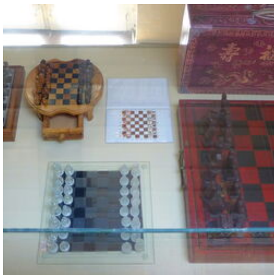
Michael Negele Museum exhibit