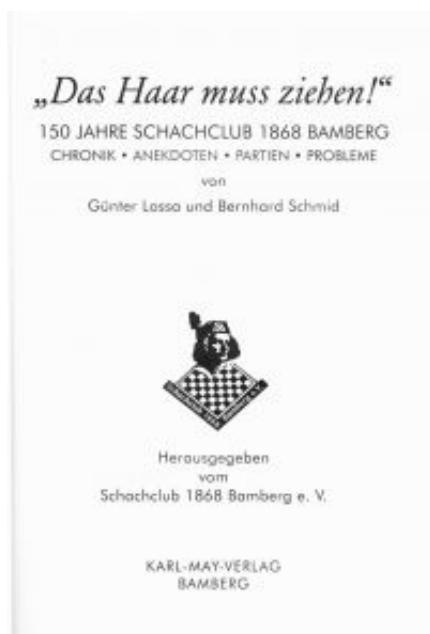
"Das Haar muss ziehen!" - titel page