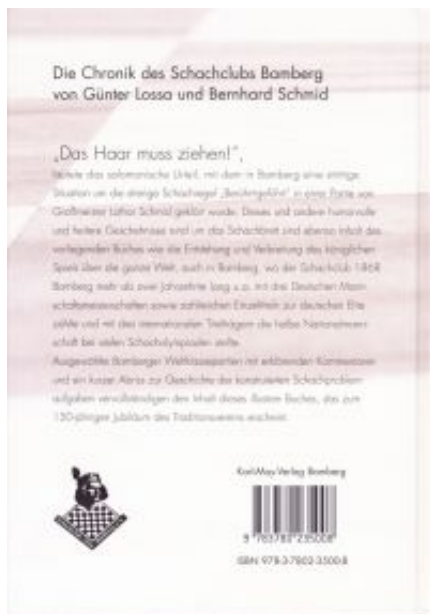
"Das Haar muss ziehen!" - back cover