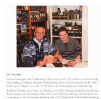
"Das Haar muss ziehen!" - Authors