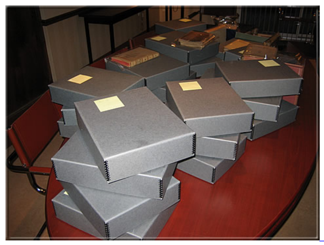
The 22 files

As my original contribution to the Lasker monograph contained substantially more material than I could use in the final version of my chapter, I had at that time the intention to write a book on Lasker as a bridge player. What's more I could easily combine this theme with 'Lasker in Holland' during the period 1920-1934, which for a considerable part corresponds with his main bridge activities. Here in the remaining portion of Lasker's legacy I had seemingly found a true goldmine that would make it possible to draw a more complete picture, especially of the ten non-chess years of his life (1925-1934). But of course I had to assess the content of those boxes with my own eyes to be sure that the material was as valuable as it promised to be.