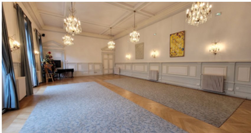
The town council room, formerly the salle des fêtes, the venue for the tournament and the signing of the FIDE foundation.