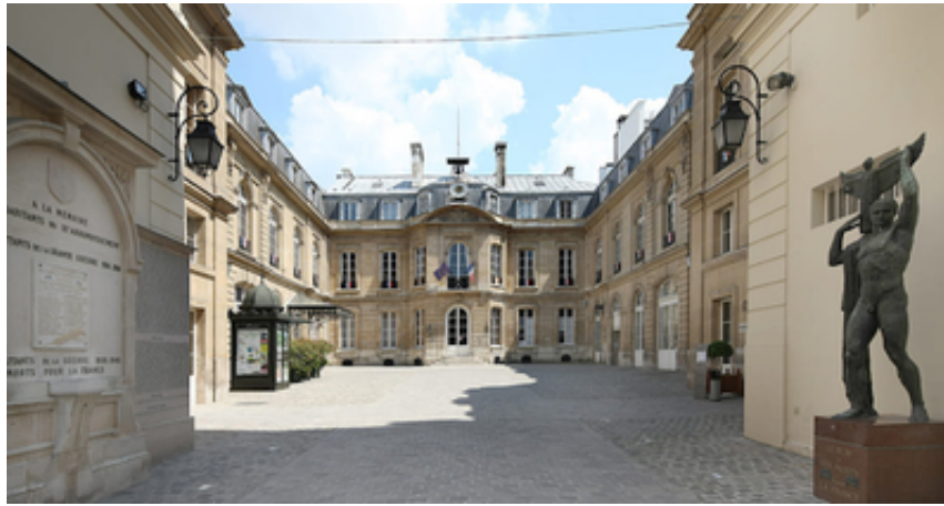
The town hall of the 9th arrondissement of Paris