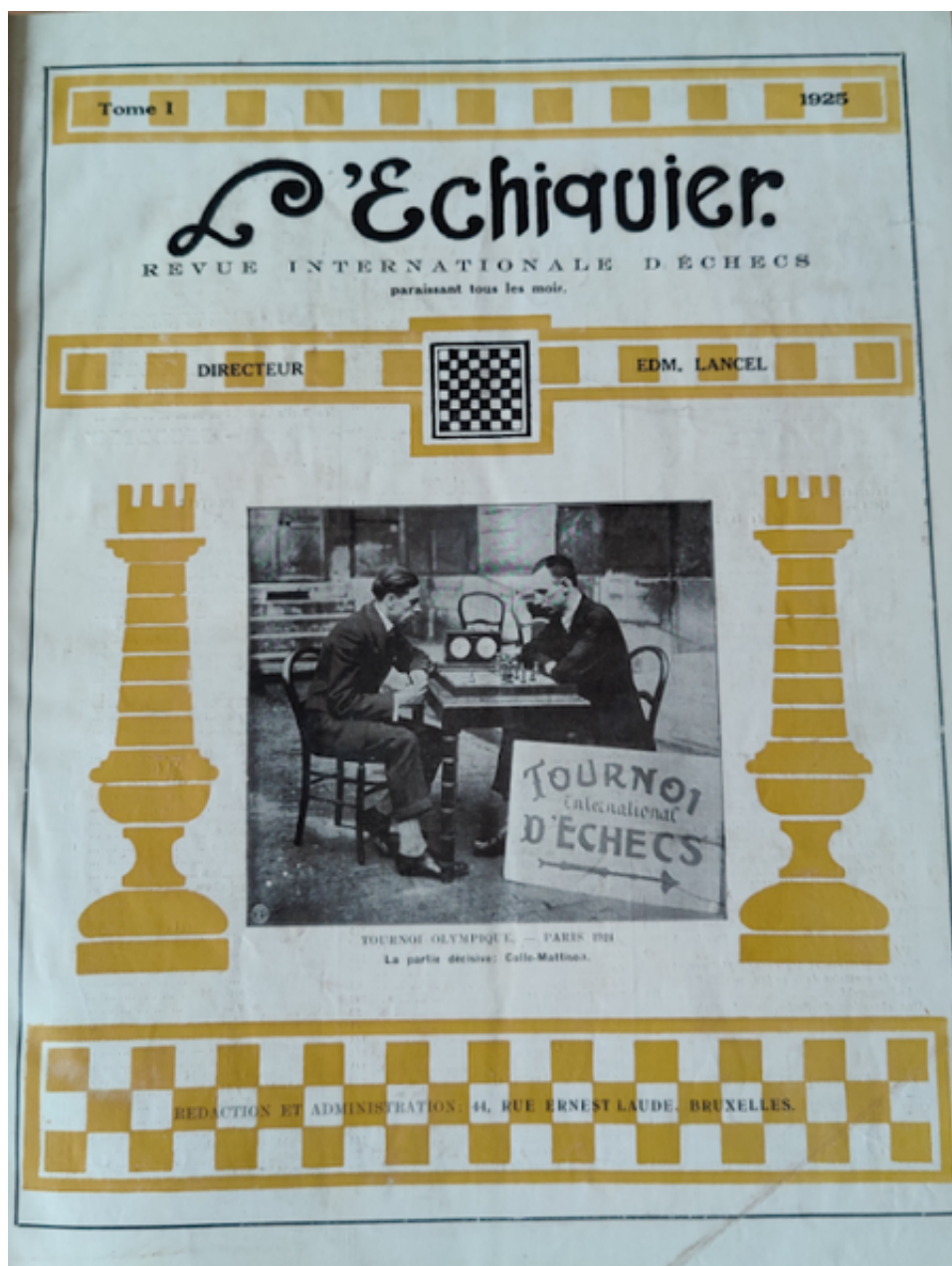
Revue L'échiquier 1925 - Photo of the decisive game to decide the winner of the individual tournament.

The winners' tournament keeps some suspense until the last game. Bulletin number 12 of the FFE states: