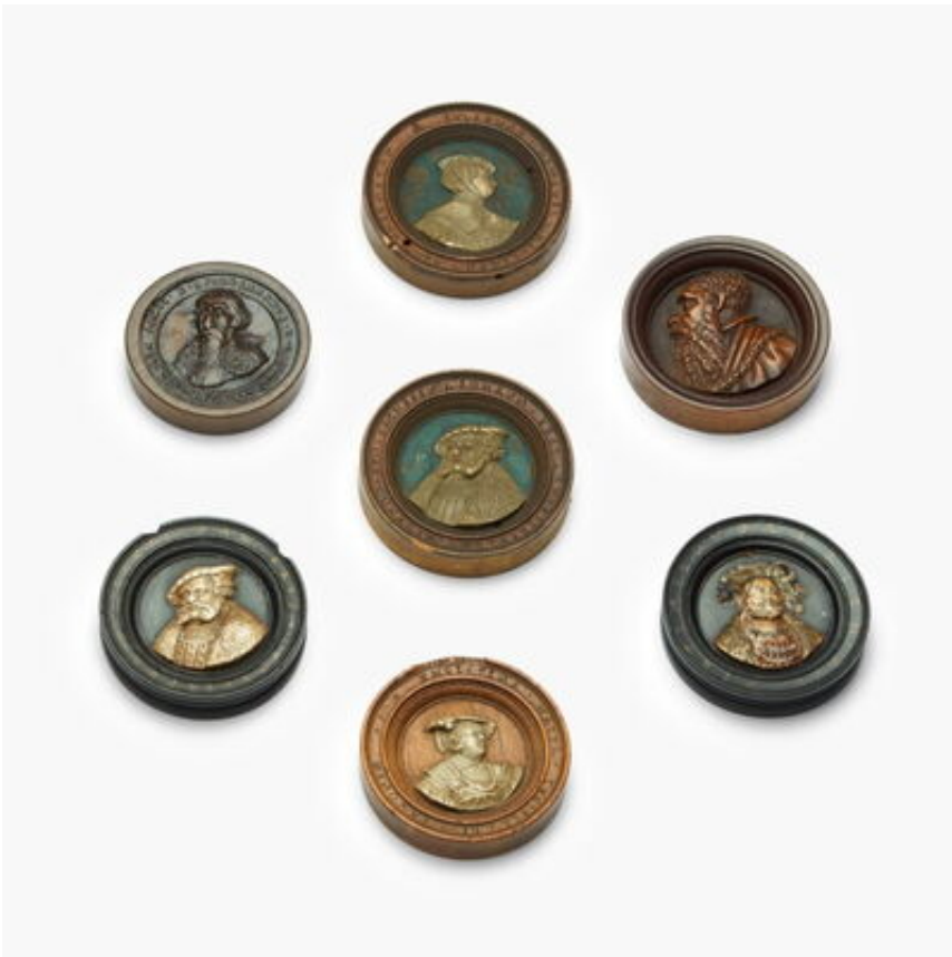
seven counters, Southern Germany, mid-16th century