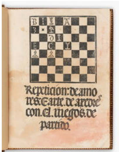
— Luis Ramírez de Lucena - Repetición de amores y arte de ajedrez