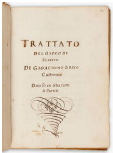
— Gioachino Greco - Trattato del gioco de scacchi