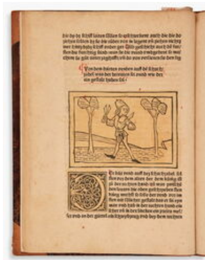
— Jacobus de Cessolis - Schachzabelbuch, Strasbourg, 1483

The presentation manuscript of Gioachino Greco's Trattato del gioco de scacchi (Rome, 1620), the so-