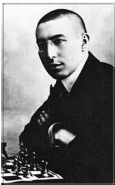
Akiwa Rubinstein before WW I (about 1912)