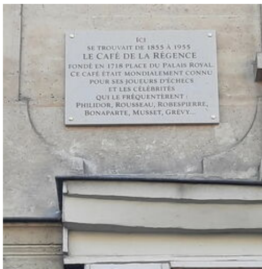
The commemorative plaque

The ceremony took place with several deputies of the Mayor of Paris, as well as the president of the French Chess Federation.