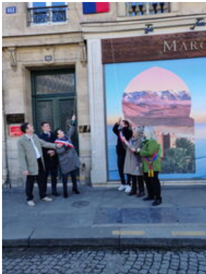
Unveiling of the commemorative plaque