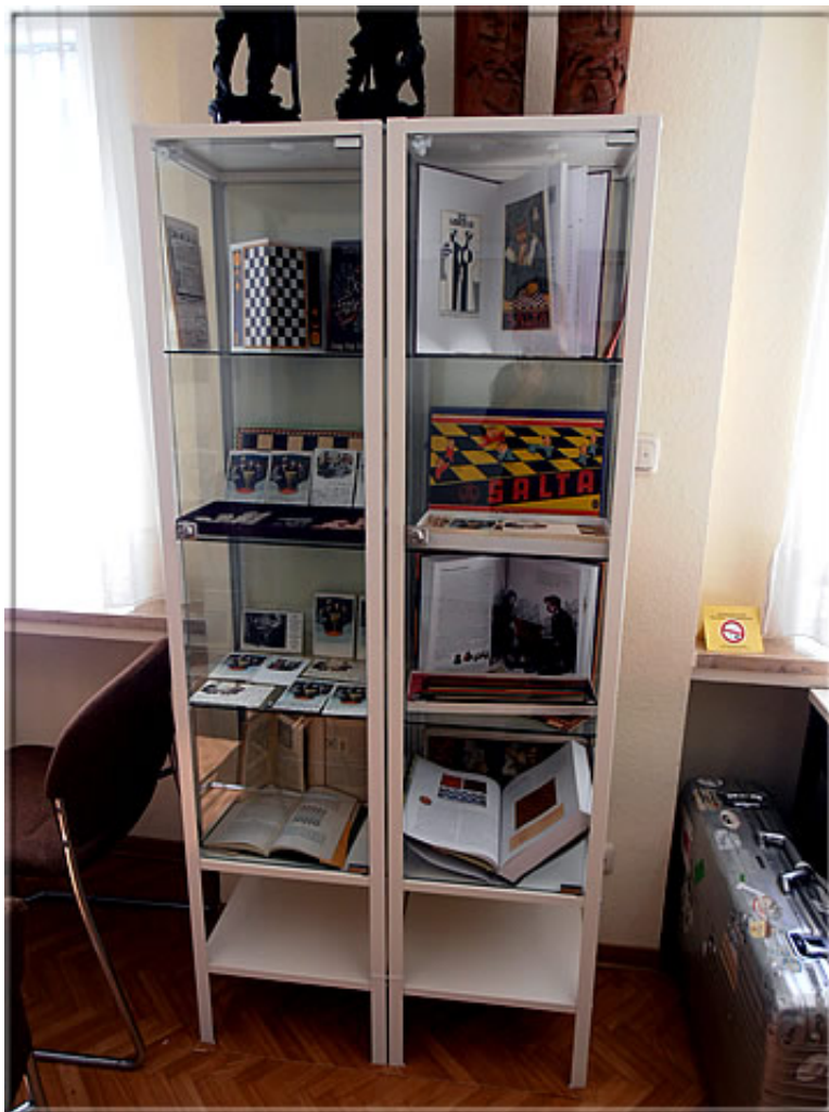
The glass cabinet with Salta exhibits from the stock of Wolfgang Angerstein