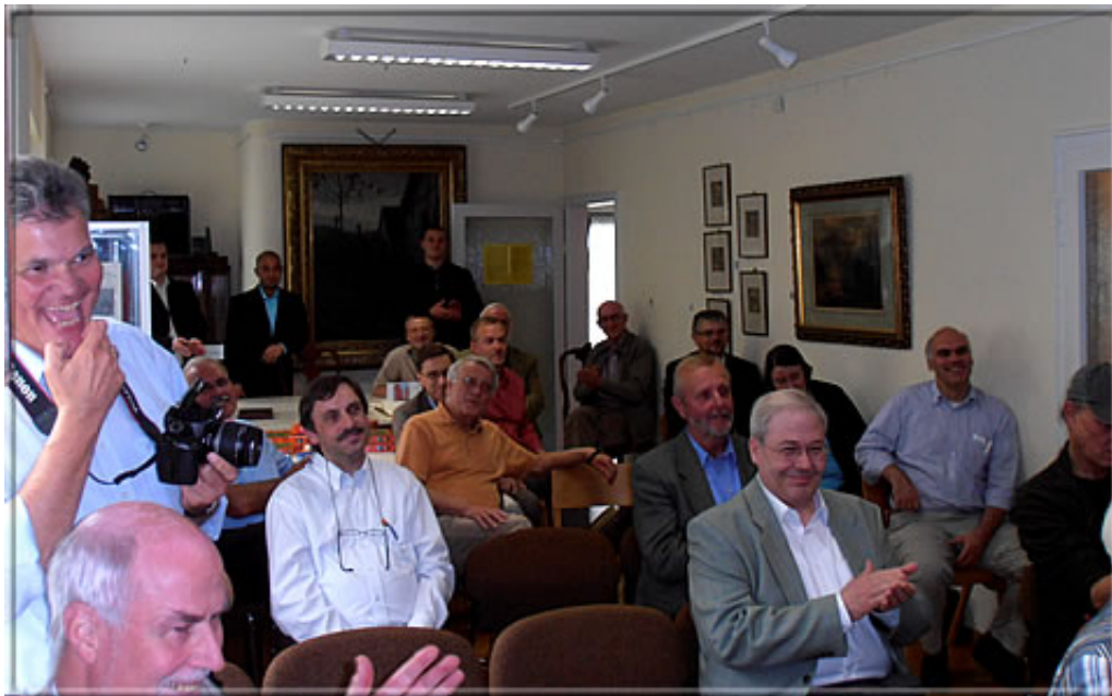
A well entertained audience