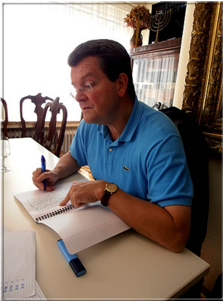
Our chairman had arrived at Brunswick as well.