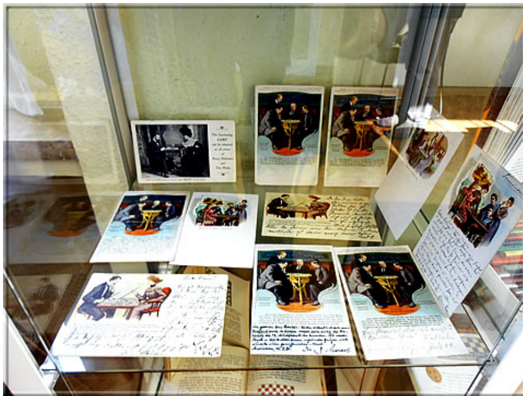
historical Salta cards