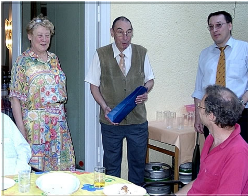
Our hosts in