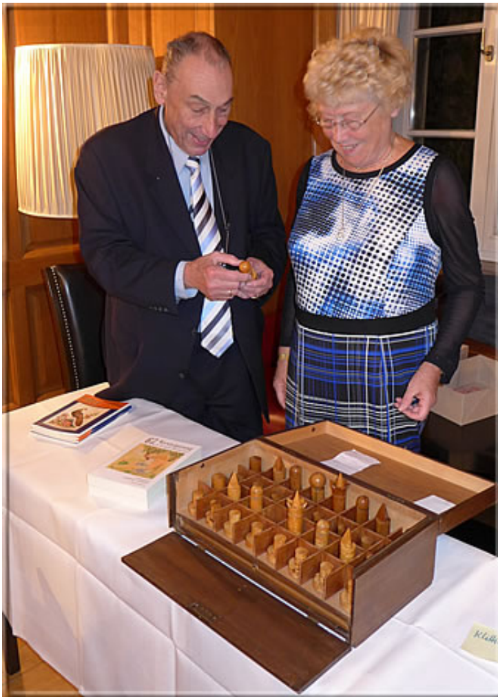
The Klittich couple, Weimar, November 2014