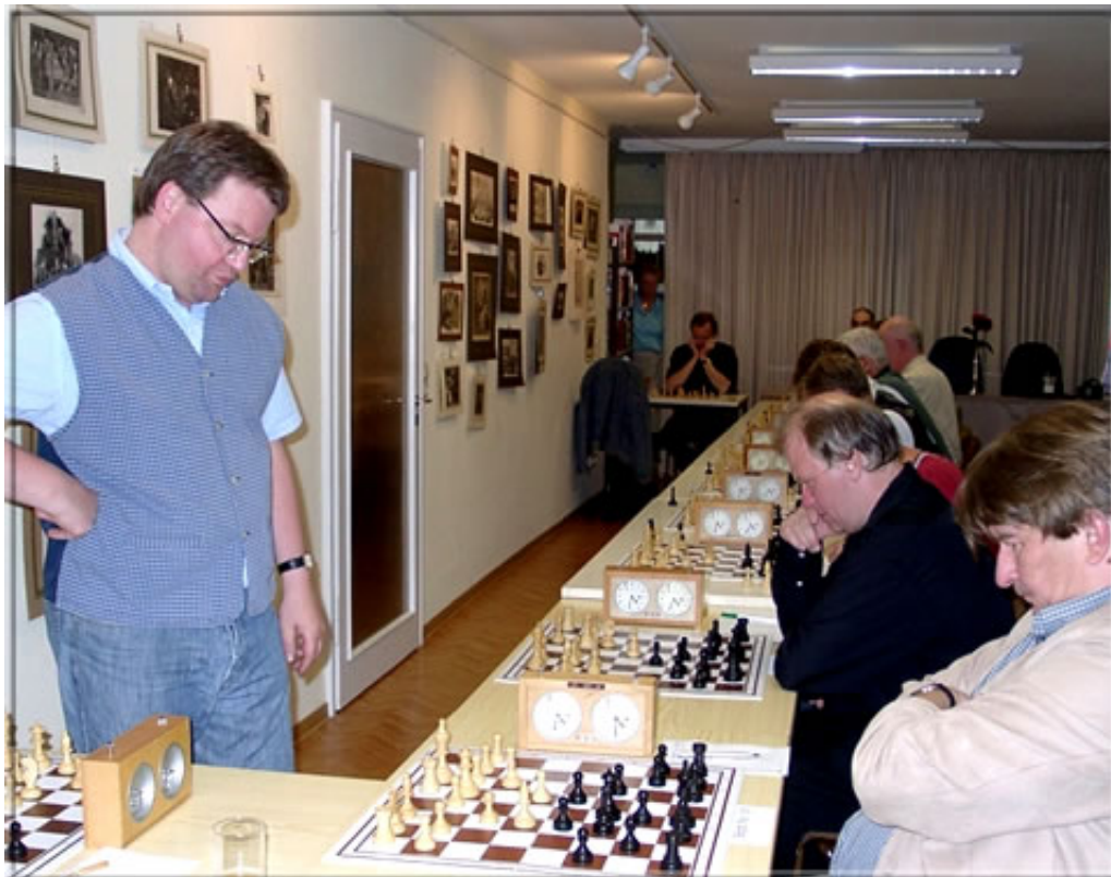
... and a clock