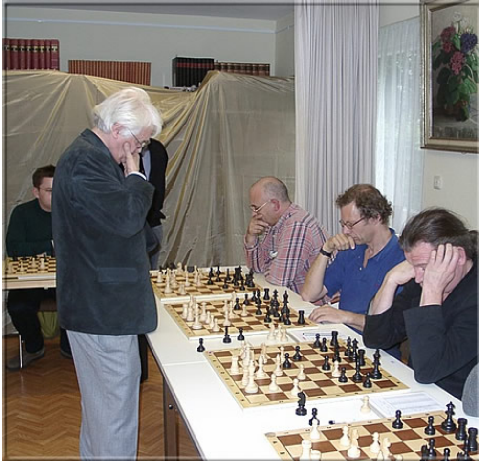
Simul by Lothar