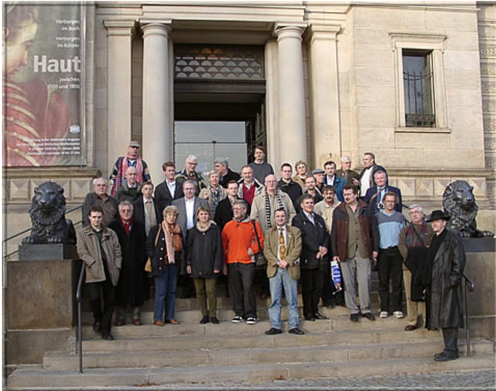
the Duke August Library (November 2003)