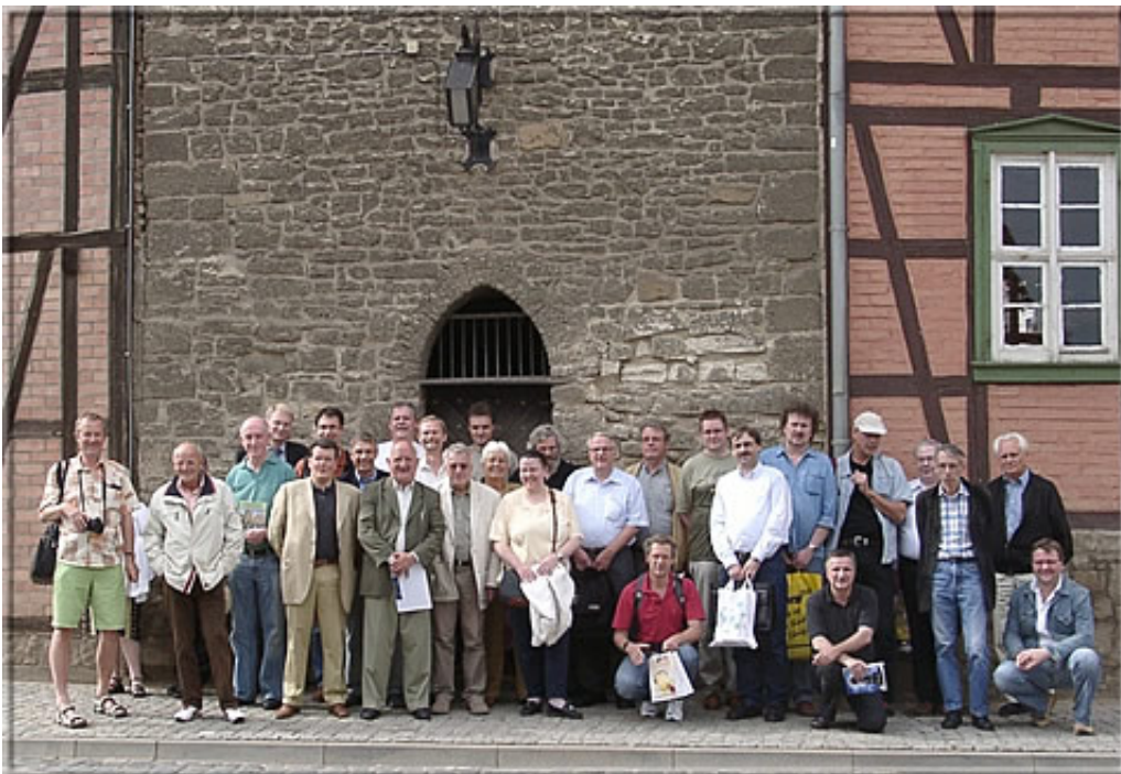
Visit of Ströbeck (June 2006)