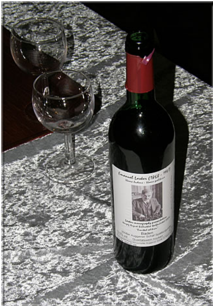
Bottle of red wine with Emanuel Lasker label