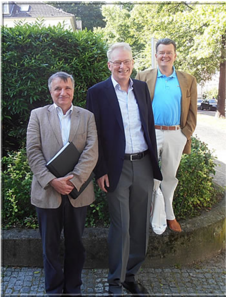
members (July 2013)