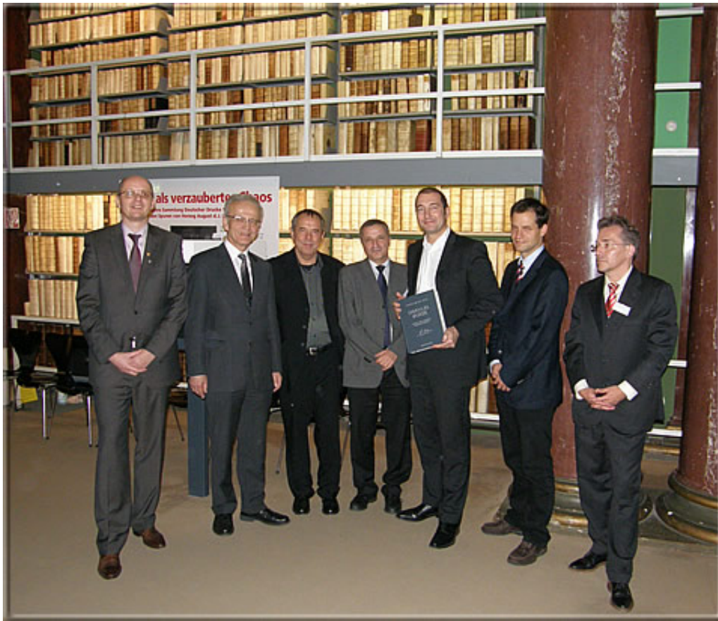
Presentation of the Lasker monograph in Wolfenbüttel (2009)