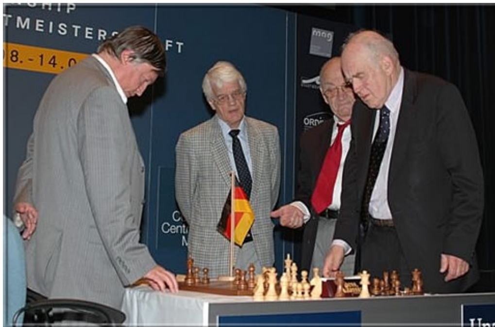
Lothar Schmid with Anatoly Karpov, Viktor Korchnoi and Wolfgang Unzicker who celebrated his 80th birthday at the Mainz Chess Classic, 2005 ("Unzicker-Gala").