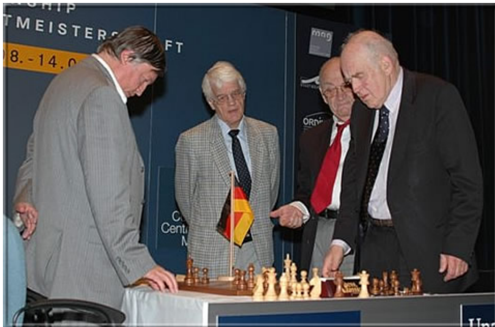
Lothar Schmid with Anatoly Karpov, Viktor Korchnoi and Wolfgang Unzicker who celebrated his 80th birthday at the Mainz Chess Classic, 2005 ("Unzicker-Gala").