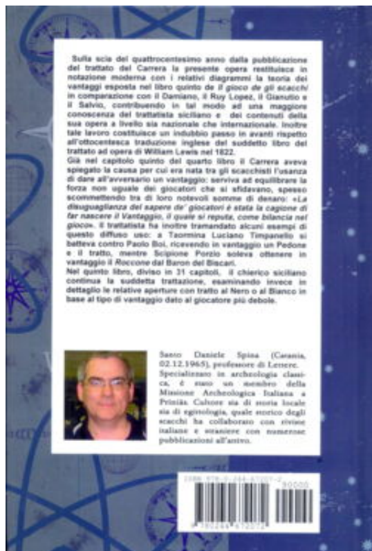
I giochi di vantaggio del libro quinto del trattato di Don Pietro