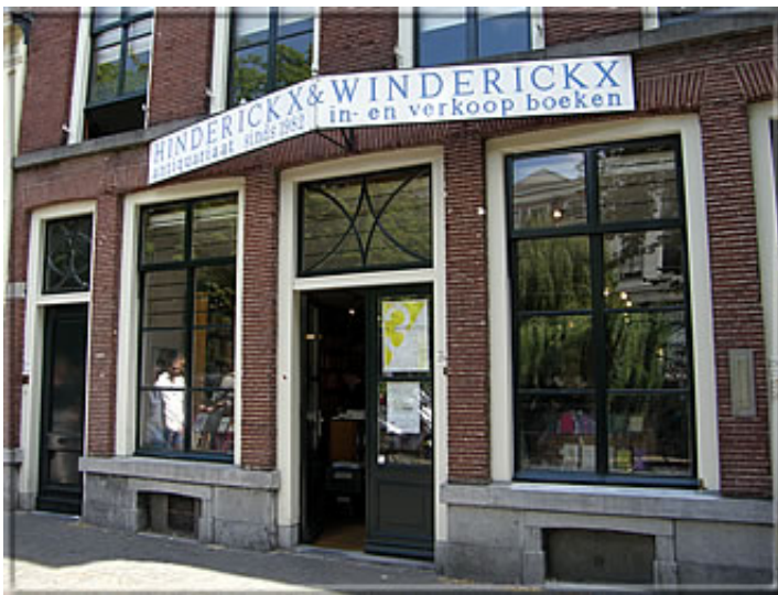
Hinderickx & Winderickx - Antiquarian bookshop since 1982 in the Oude Gracht 234