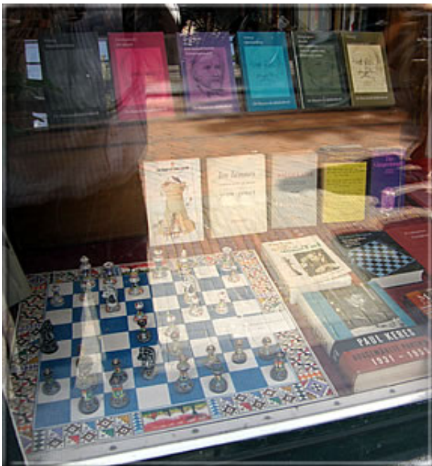
A look into the chess decorated shop window