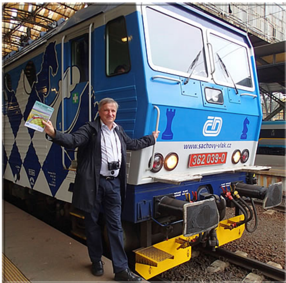
A promising start in