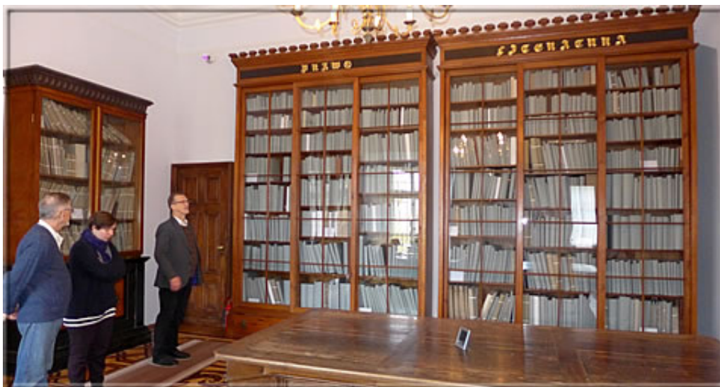
In the library of

Kórnik Castle - but not the Lasz collection