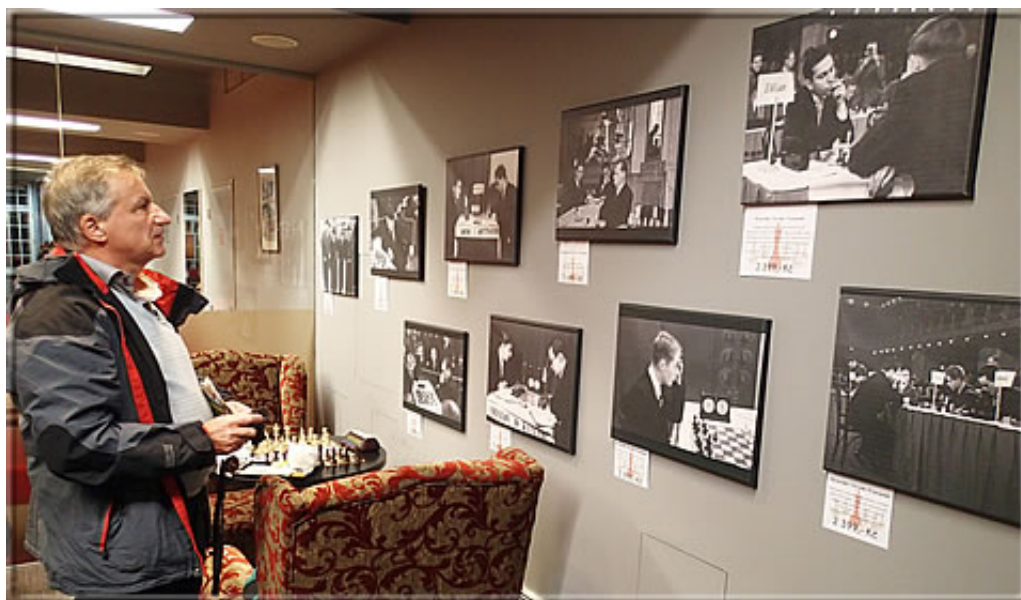
Amazing photos and prizes in the new Prague chess café on Wenzelplatz