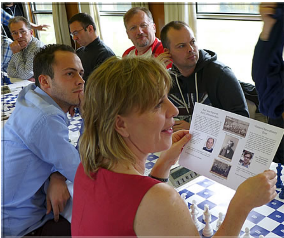
Announcement of the Vienna Chess History Tour "Auf den Spuren der Luftmenschen"