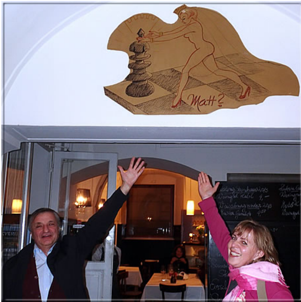
Vienna eating house