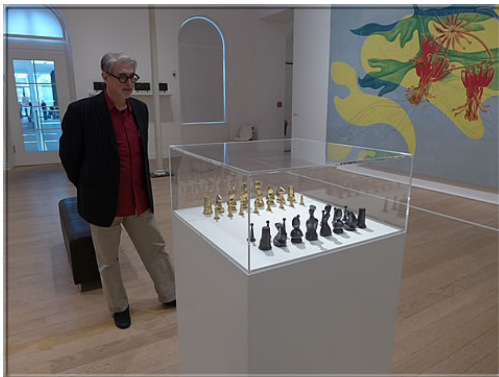
Another chess set