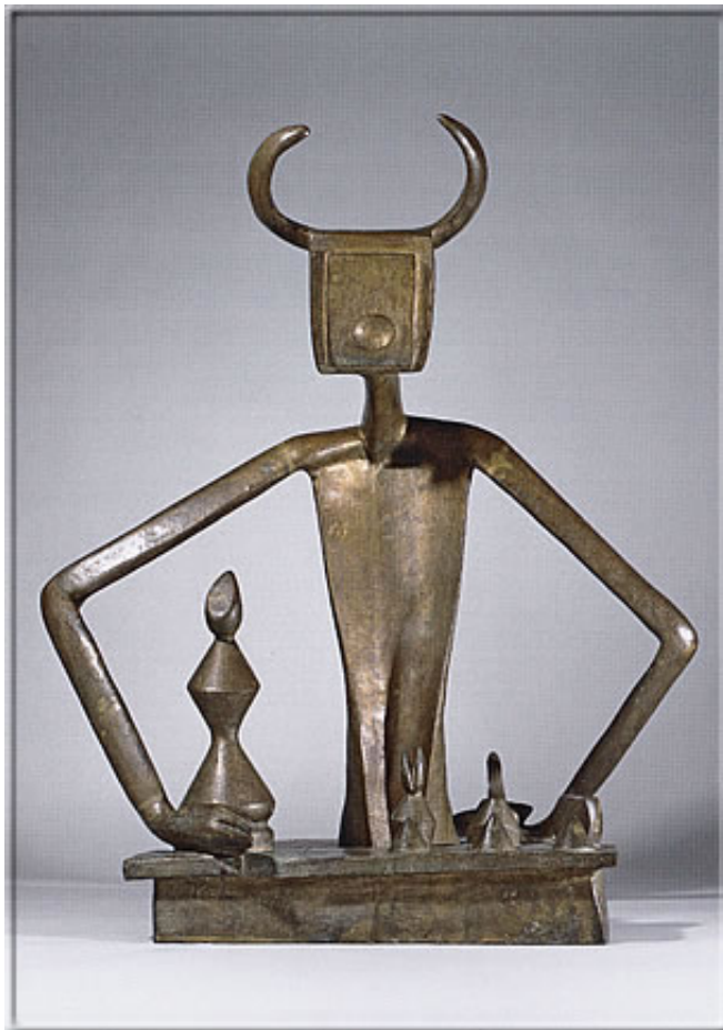
Postcard Max Ernst

• Max Ernst The King playing with the Queen, 1944 Dauerleihgabe der Kreissparkasse Köln Max Ernst Museum Brühl