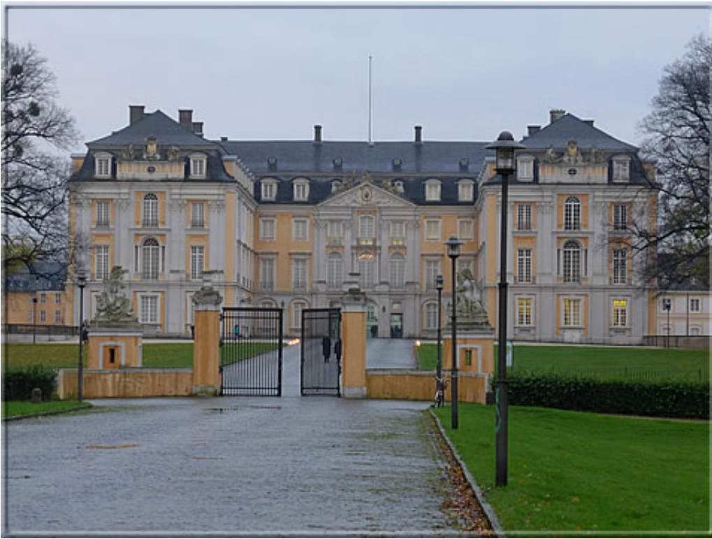
The Augustusburg Palace

... but that was easy to correct, and first we had a look at the Hans Arp special exhibition, even there we found some chess motifs.