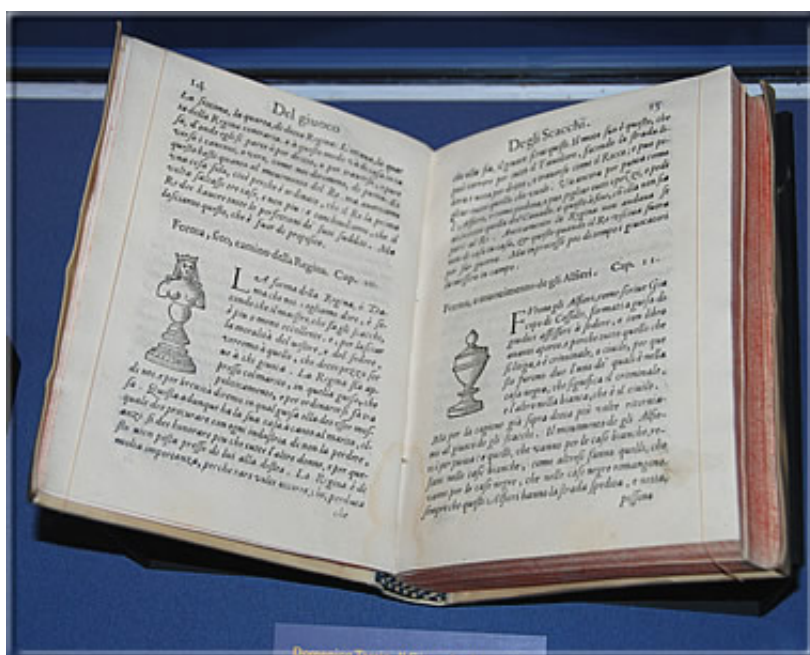
Domenico Tarsia: Il giuoco de gli scacchi (Venetia, 1584)

For writing his work Duke August considerably fell back upon the chess literature existing at that time, which he also purchased, among them especially the above shown book by Domenico Tarsia which is nothing else but the Italian translation of the famous work by Ruy López de Segura from 1561, Libro de la invención liberal y arte del juego del Axedrez .