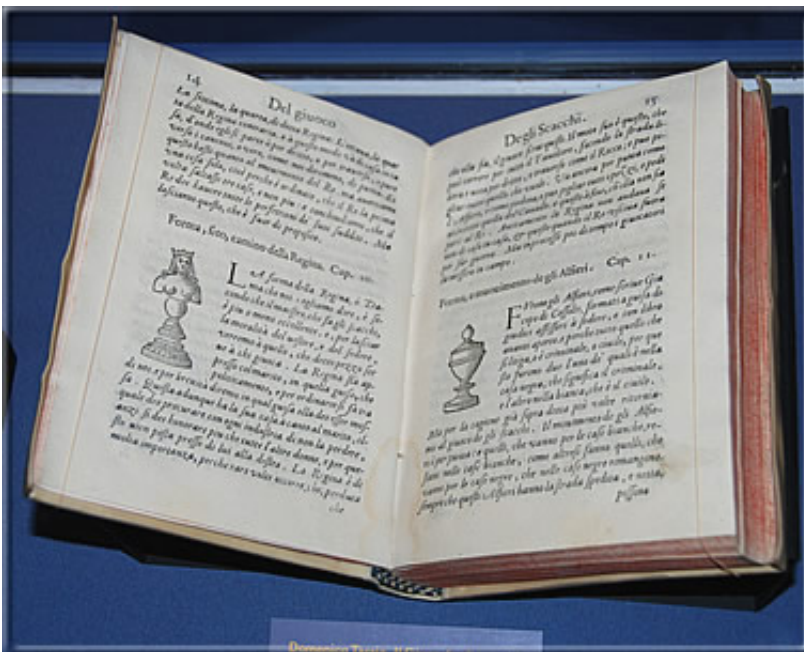
Domenico Tarsia: Il giuoco de gli scacchi (Venetia, 1584)

For writing his work Duke August considerably fell back upon the chess literature existing at that time, which he also purchased, among them especially the above shown book by Domenico Tarsia which is nothing else but the Italian translation of the famous work by Ruy López de Segura from 1561, Libro de la invención liberal y arte del juego del Axedrez .