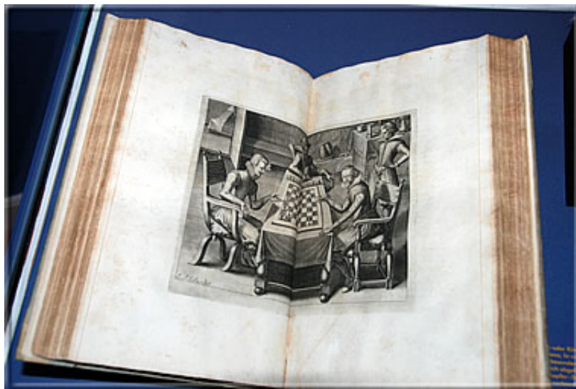
... which can be found at a central place of the "SELENUS".

Interesting enough, the title copperplate of the "Selenus" contains a series of allegorical portrayals with motifs taken from the ancient Greek mythology, only Palamedes, Odysseus and the Trojan War will be mentioned here as "key words". In the lower part of the title page the Duke appears as Columbus involved in a discussion with Spanish noblemen, even the "egg of Columbus" comes to life again. We are not able to give a more detailed exposition here but those with a thirst for knowledge will learn considerably more at this web page of the "Lippische Landesbibliothek Detmold" (in German only): "Schach dem Herzog!" ("Check the Duke!")