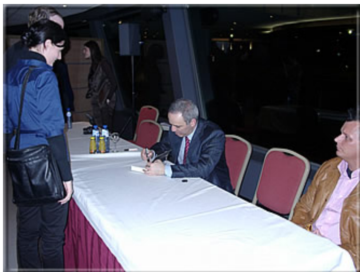
Kasparov's autograph session