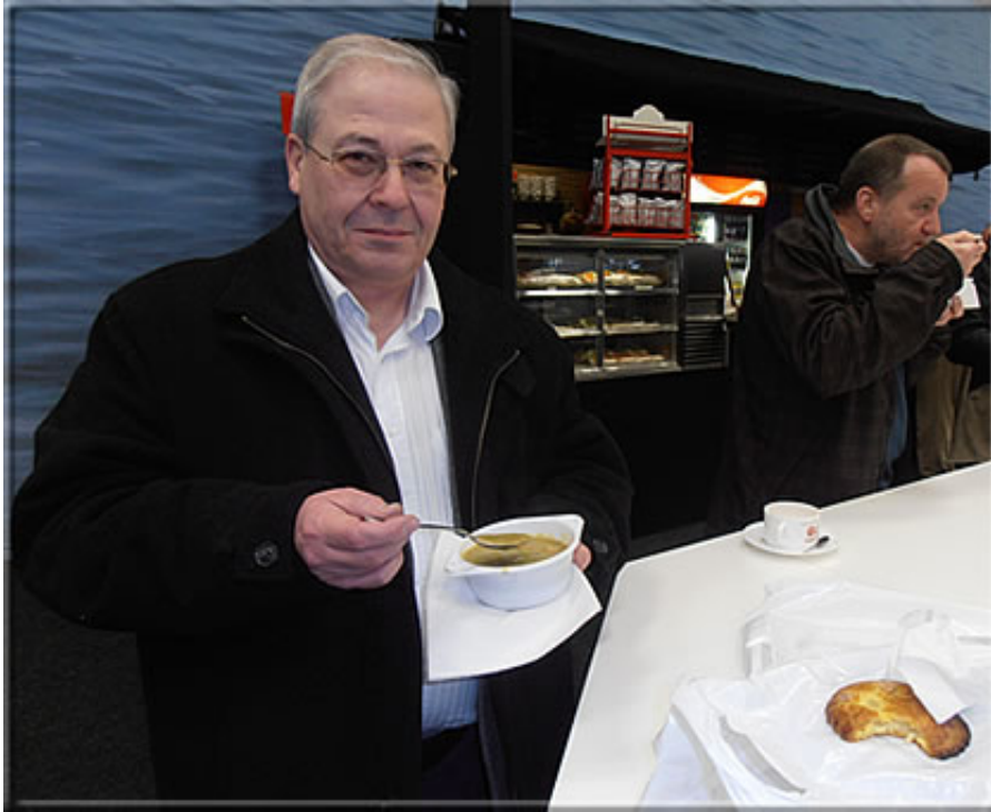
_ In the tournament hall: Pea soup

Also the following Monday the glorious winter weather with bright sunshine continued. This picture gallery offers a selection of photos from some stops on the way from Zandvoort to Wijk, from a walking-tour through the dunes of Wijk as well as from the third round of the tournament which we had to leave early for the journey home.