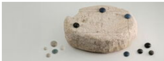
A 3D reconstruction of the stone with its corresponding pieces.