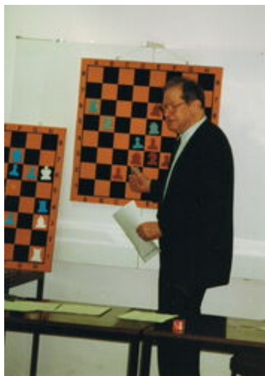
Yuri Averbakh giving a lecture in Hamburg, 1999