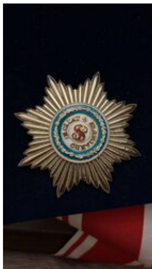
Eugenia Taimanova Decoration from the Imperial family