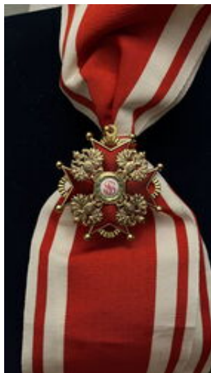
Eugenia Taimanova Decoration from the Imperial family