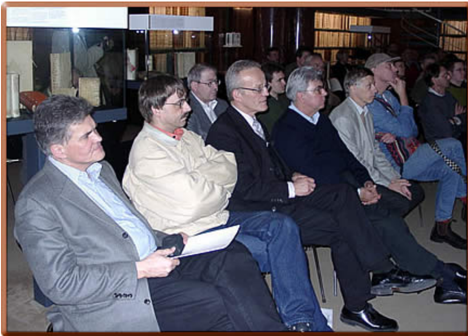
... and the interested