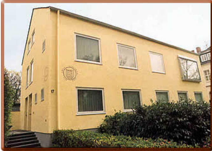
The auction house Klittich-Pfankuch on Theaterwall

Back from Wolfenbüttel there was a well-deserved break in the auction house on Theaterwall, which kept the guests happy with beer straight from the wood and additional snacks. As in the meantime even those participants had arrived who had not been able to get to Wolfenbüttel, the foundation meeting started at the auction hall after a small delay, at 17:30 p.m.