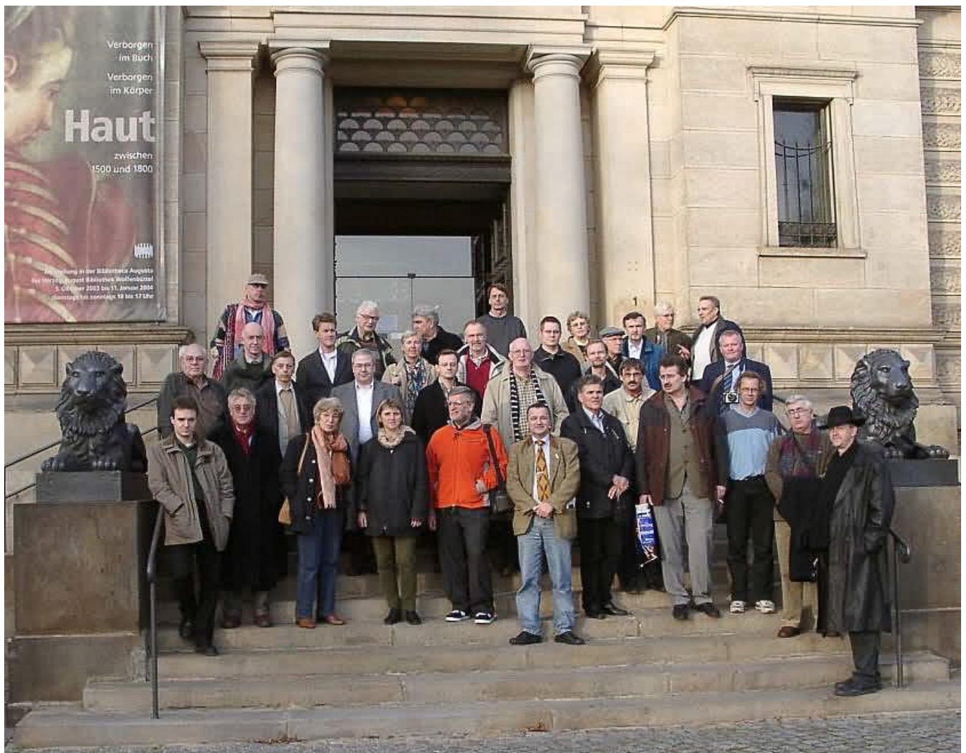
_ Visitors to the Duke August Library, Wolfenbüttel