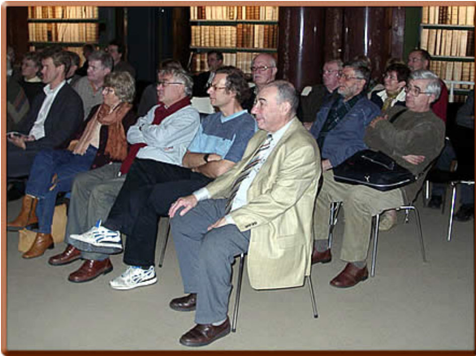
... this time from a different perspective