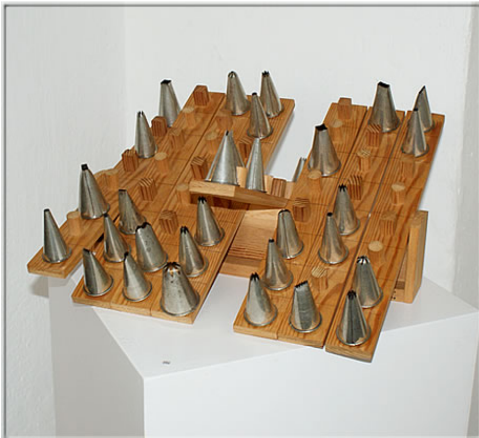
• Another whimsical chess set