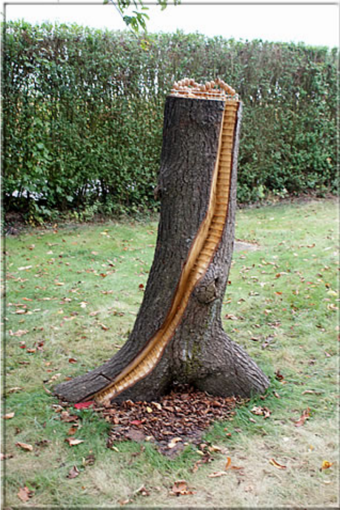
Chess for Mice and Squirrels