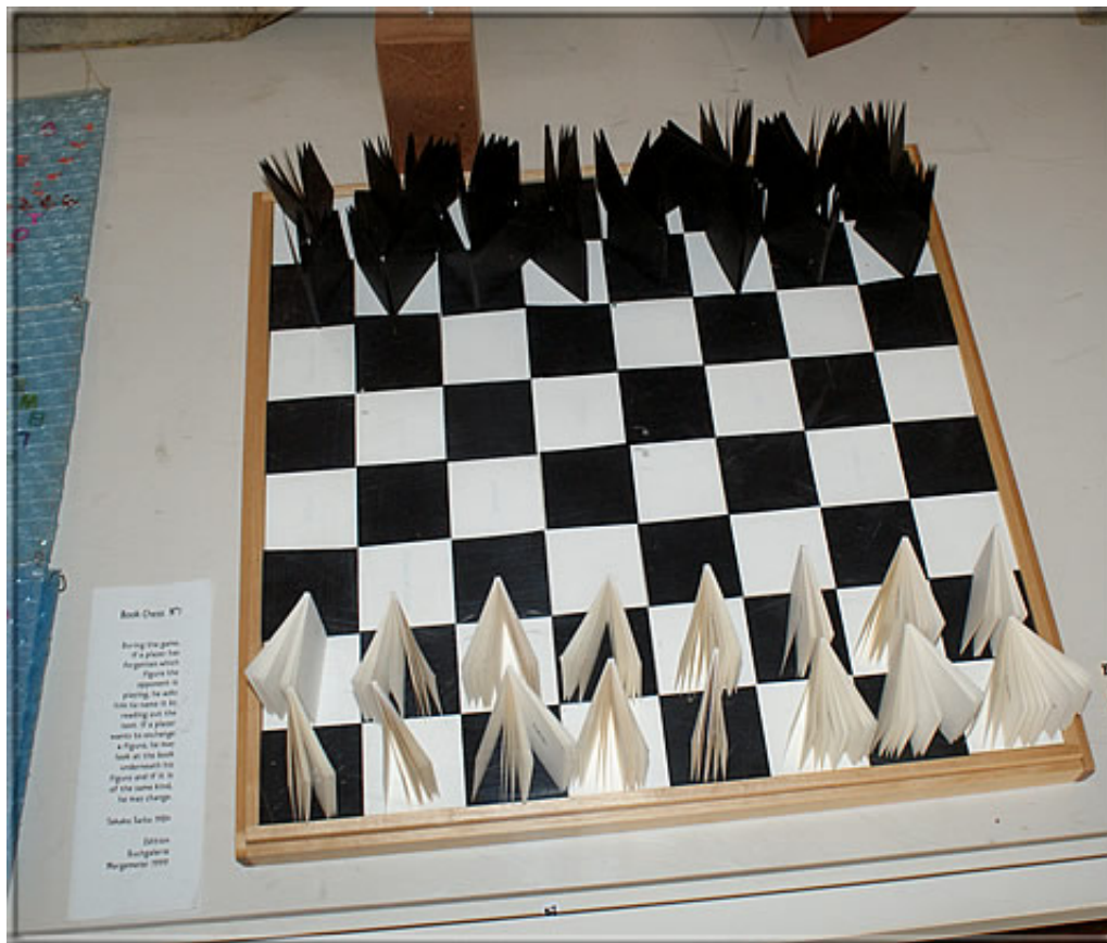
Book Chess No