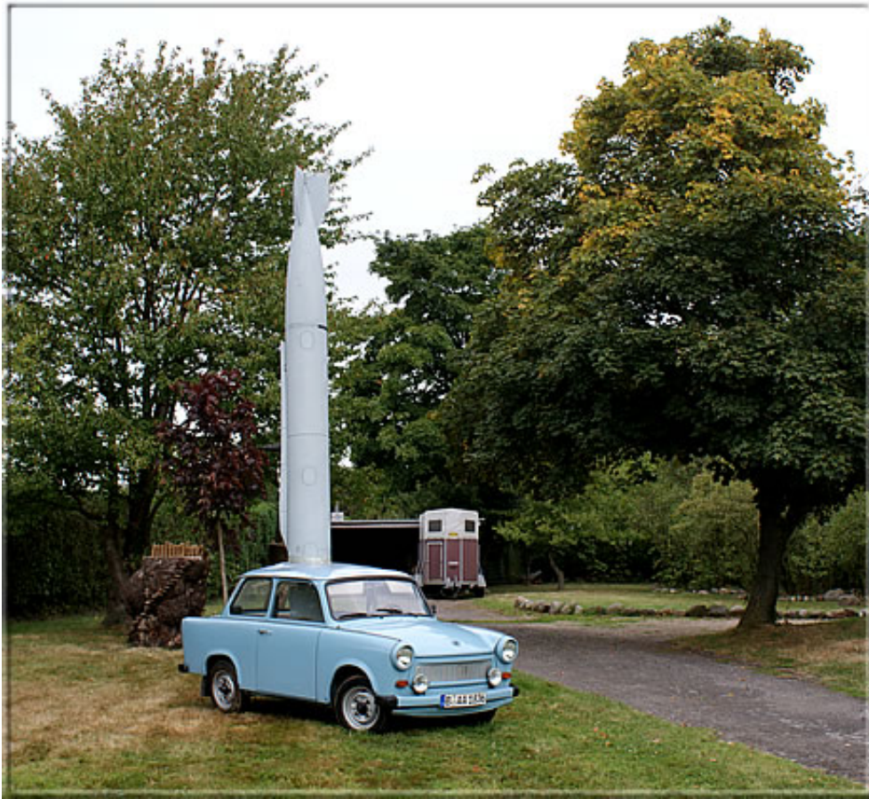
"Unification of capitalism and freedom" by Pit Bohne: Carrier rocket has struck a Trabi – symbol for the clash between East and West.