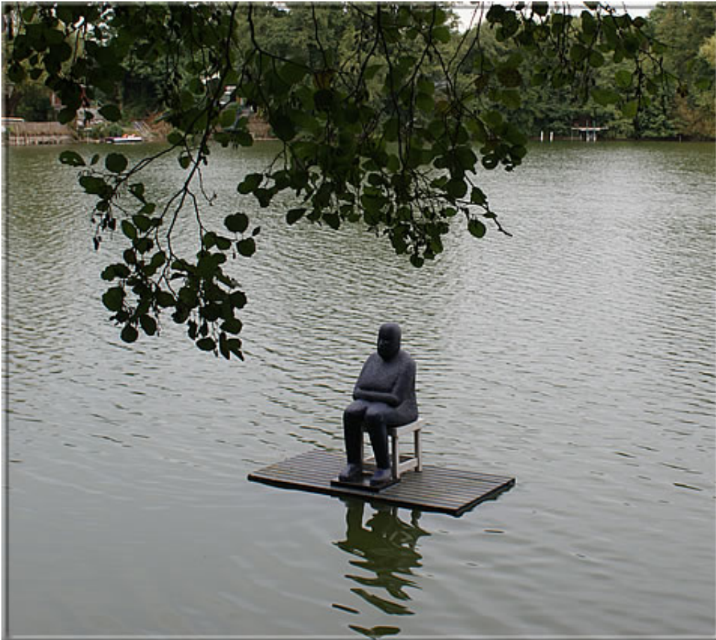
• Installation "Auf dem See" by Gabriele Fekete: A pontoon with a sitting person swimming on Lake Silbersee.