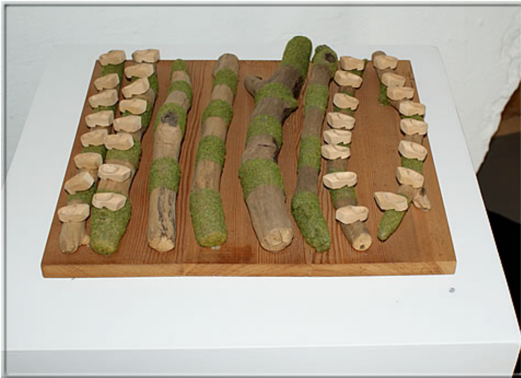
• "Schachspiel im Wald" (Chess in the Forest) - all the chessmen consist of apparently identical little clogs – they distinguish from one another by different notches in the soles (underneath)!