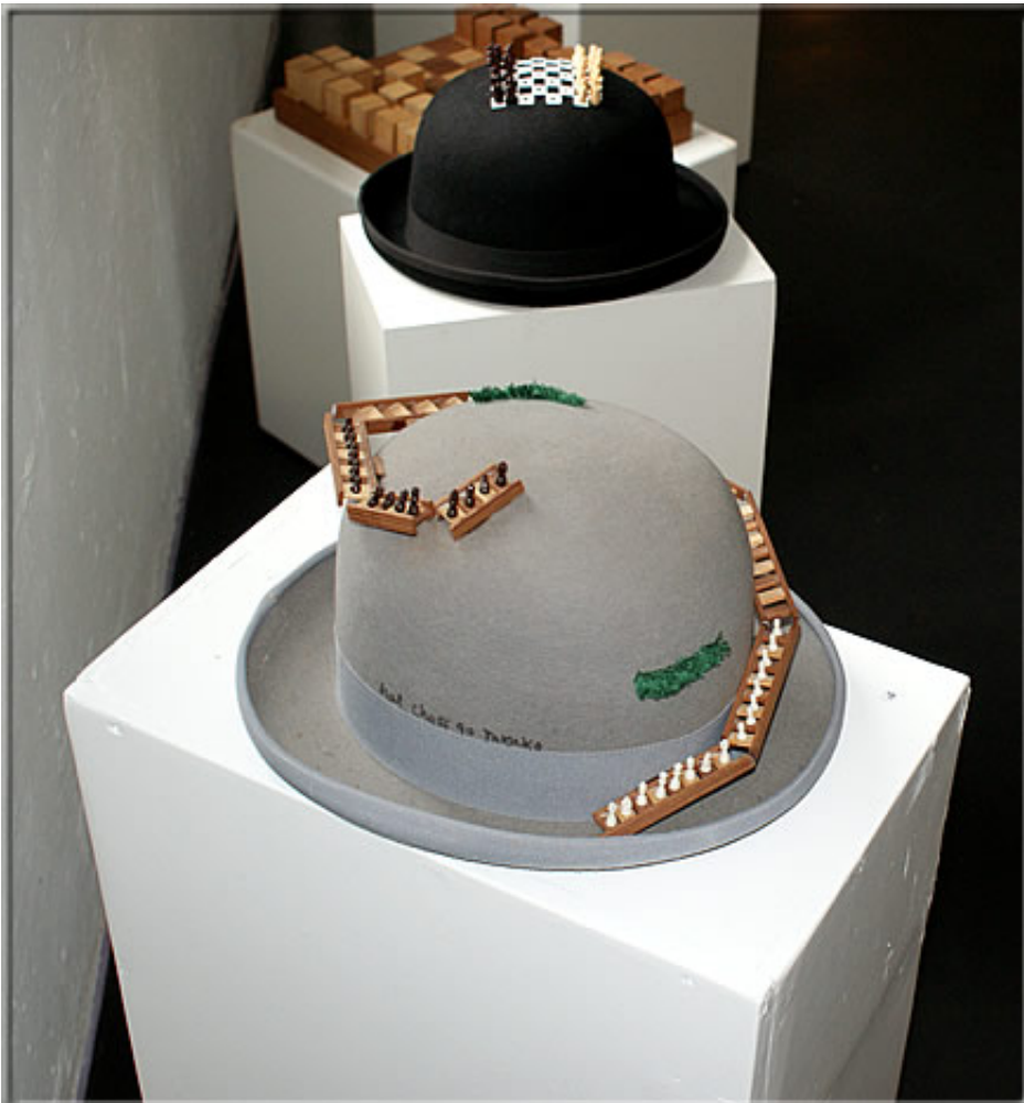
"Hat chess" – bowlers with spiral chess stair and mini board respectively – highly original!