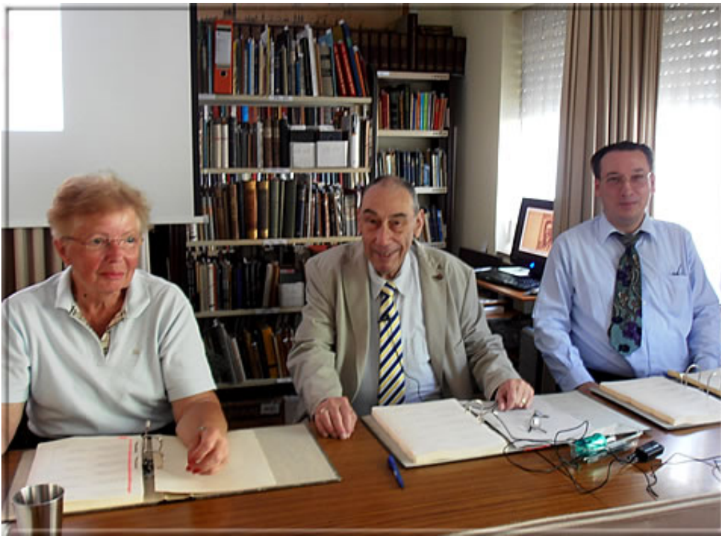
Just before the start of the auction