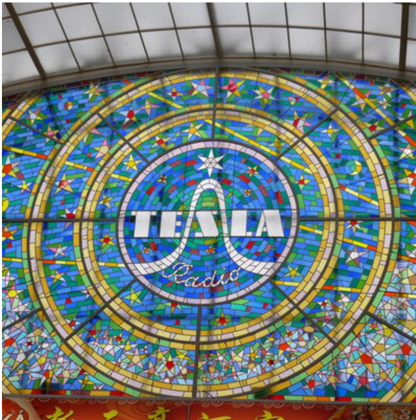
Stained glass with logo of Tesla Radio in Pasáž Světozor, Prague 2015