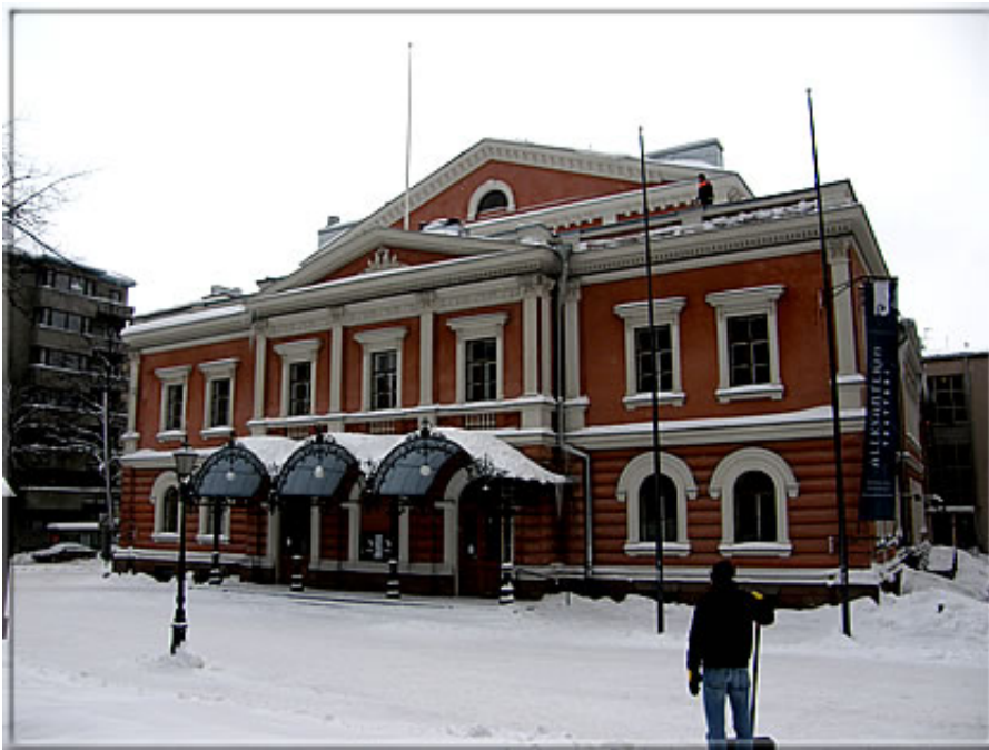
The Alexander Theatre, directly adjacent to the hotel