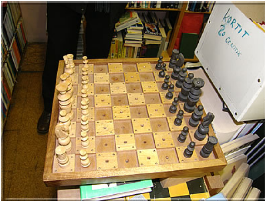
A special chess set for blind persons