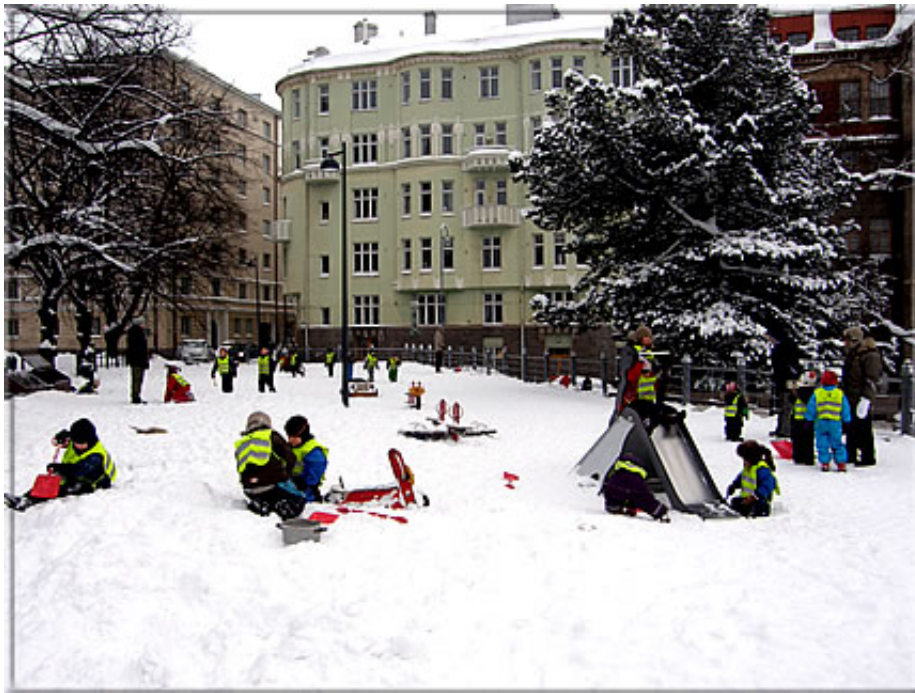
Children in the "snowbox" instead of sand – that will harden.