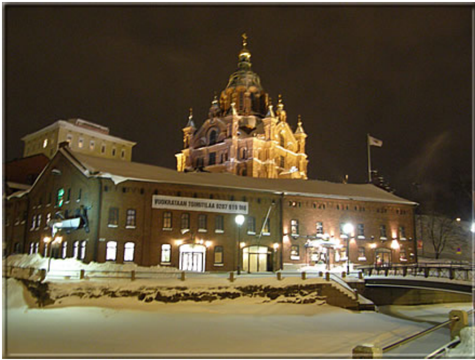
The Uspenski Cathedral "towers" over the harbour, the Russian influence is distinctive. It was ice-cold here.