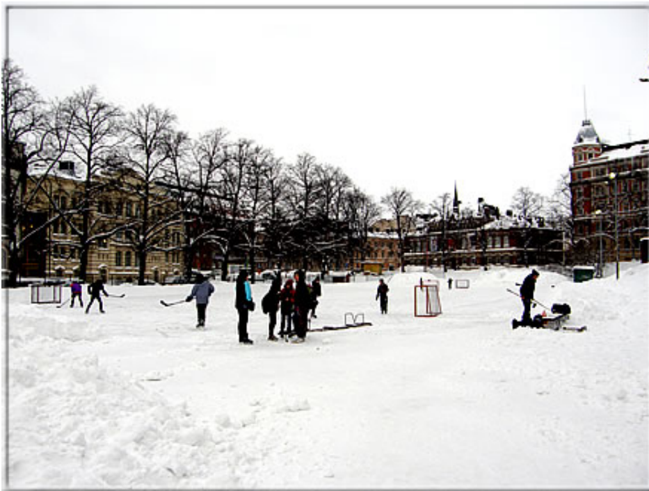
Ice hockey – national sport in Finland